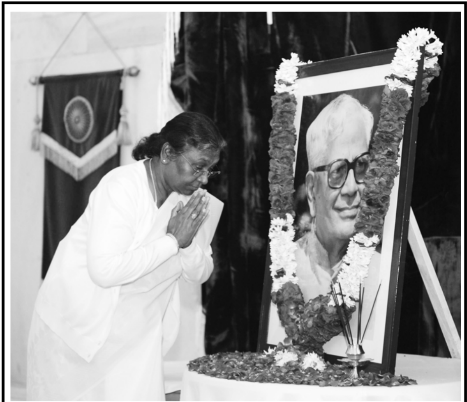
President Droupadi Murmu, paid floral tributes to R. Venkataraman, former President of India, on his birth anniversary at Rashtrapati Bhavan on Sunday

He lauded the daughters of Haryana for bringing laurels for the country by winning medals in various disciplines. He called upon universities and educational institutions to upgrade sports infrastructure and the youth to actively participate in 'Fit India Movement' stressing upon 'Fitness Ka Dose, Aadha Ghanta Roz' to be fit and healthy. The minister congratulated the students who graduated and got degrees in the first ever convocation of the university. He also interacted with the youth on this occasion. The minister later visited the Doordarshan Kendra of Hisar.