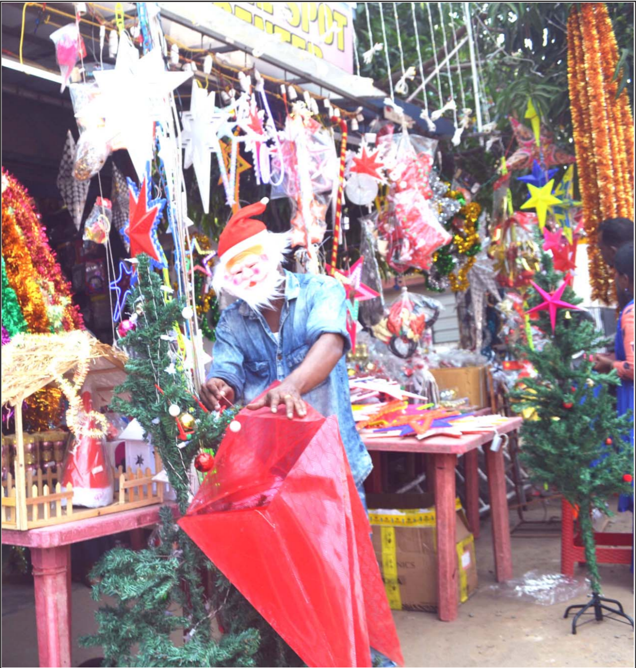
Shops are being decorated eyeing sales in view of upcoming Christmas and New year festival,In Thiruvananthapuram on Sunday

It is high time that these young people get their well-deserved right to participate in the most crucial decision making process in running the country. (IPA)