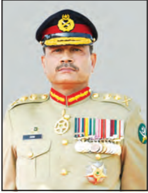
General Asim Munir