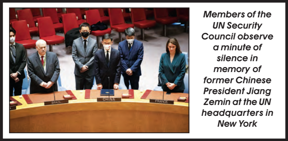
Members of the UN Security Council observe a minute of silence in memory of former Chinese President Jiang Zemin at the UN headquarters in New York

Iran denies it is seeking such weapons and has vowed a harsh response to any Israeli aggression. In January, Israel said it had broken up an Iranian spy ring that recruited Israeli women via social media to photograph sensitive sites, gather intelligence and encourage their sons to join Israeli military intelligence. (AP)