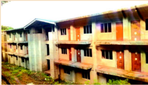
Pic shows upcoming triple storied building of Girls Hostel at ANCOL campus.

With a focus to provide affordable and comfortable accommodation for girl students, a new spacious hostel building for girl students pursuing higher education in Andaman College (ANCOL) is being constructed at the college campus. APWD sources informed that as on date, 84 percent work has been completed. The 100-bedded capacity hostel building is a