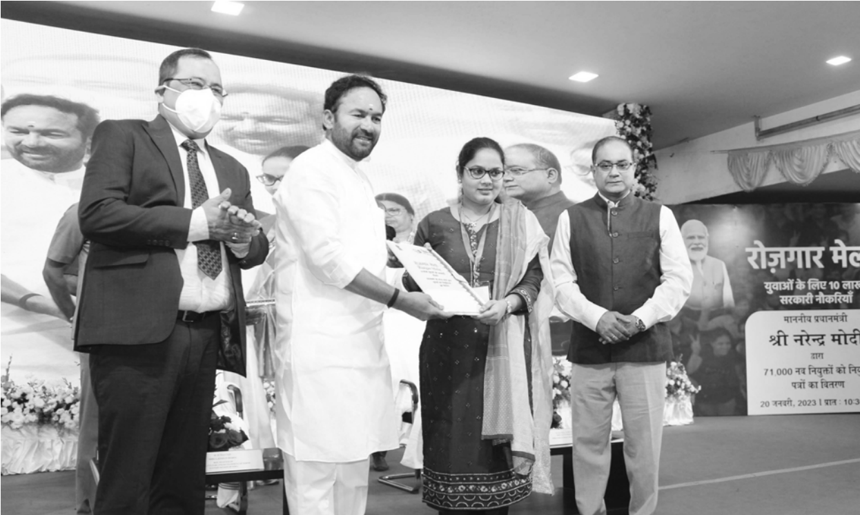
Union Minister For Culture Tourism and Development of North Eastern Region (DoNER), G Kishan Reddy giving appointment letters to the newly selected candidates of Telangana State at Swami Vivekanand Institute of Technology (SVIT) Auditorium, Clock Tower, in Secunderabad

MUMBAI, JAN 20 /--/ The Bharatiya Janata Party on Friday mocked Shiv Sena (UBT) leader Sanjay Raut for taking part in the Rahul Gandhi-led 'Bharat Jodo Yatra' and said the more he walks with the Congress leader, the more the doors of victory will close for Uddhav Thackeray's outfit. Raut, who had joined Rahul after the march started its Jammu and Kashmir leg on Thursday, had told reporters he was taking part on behalf of his party as "the atmosphere in the country is changing fast and I am seeing Gandhi as a leader who is raising his voice on real issues". "He should walk fearlessly with Rahul Gandhi. The more Sanjay Raut walks with Rahul Gandhi, the more the doors of victory will get closed for Uddhavji's Sena," Mumbai BJP chief Ashish Shelar said here. Shelar said Raut was "hiding in an alley in Prabhadevi" (where the office of Shiv Sena (UBT) mouthpiece 'Saamana' is situated) when 'karsevaks' were sacrificing their lives in the Ramjanmabhoomi movement (for a Ram Temple in Ayodhya). (PTI)