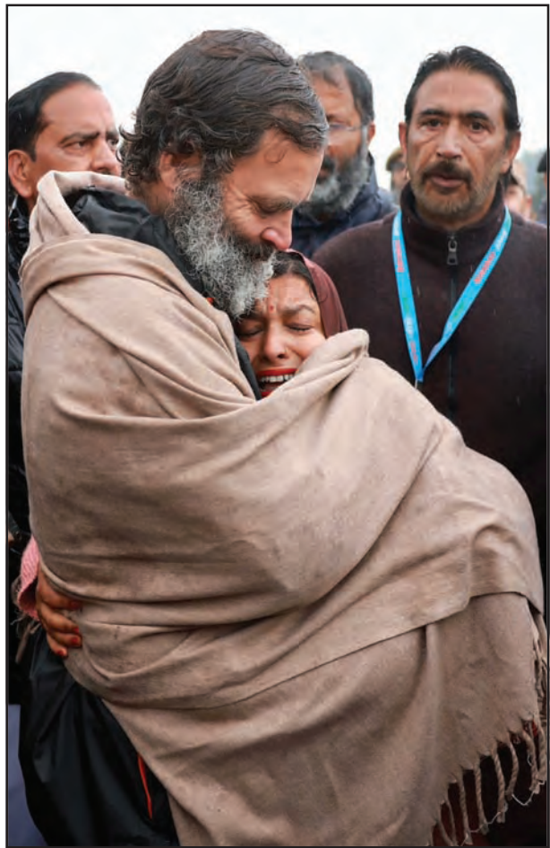
Congress leader Rahul Gandhi with supporter during the party's 'Bharat Jodo Yatra', in Kathua, on Friday

attention has to be paid," he said. Shah said to make internal security impenetrable, the police have to be empowered and the Modi government and the home ministry will fully cooperate with states. Referring to the situation in Jammu and Kashmir after the abrogation of Article 370, the home minister said there was a time when children from Jammu and Kashmir used to go to study in other parts of the country due to militancy. "But today 32,000 children from other parts of the country are studying in Jammu and Kashmir," Shah said. "Similarly the amount of investment that has come in the last four years is more than what it had come to Jammu and Kashmir in the last 70 years," he said. (PTI)