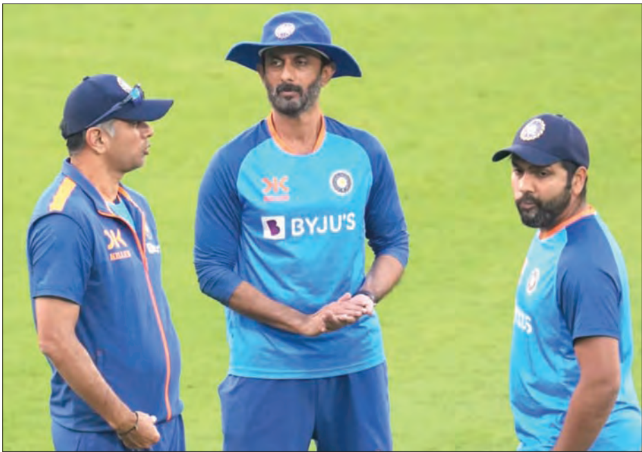
Vikram Rathour, Rahul Dravid and Rohit Sharma are in conversation

RAIPUR, JAN 20 /--/ India will be expecting more runs from the middle order and discipline in the death overs as they look for a series sealing win against New Zealand in the second ODI here on Saturday. With the city hosting its first-ever international game, a sell out crowd of 60,000 plus is expected to cheer the home team. After being down and out at 131 for six, New Zealand were allowed to score another 206 runs in the chase of 350 and that should worry India. The visitors looked like getting a remarkable come-from-behind win but the individual brilliance of Mohammed Siraj stopped them. With the bat, Shubman Gill, who scored a scintillating double century, had singlehandedly taken India to a competitive total with the others falling by the wayside. Virat Kohli's individual effort had stood out in the previous game against Sri Lanka. Hardik Pandya, who has not been at his belligerent best of late, will be expected to give final flourish to the innings. Accommodated in the middle-order following his double hundred performance in Bangladesh, Ishan Kishan would be itching to make the most of the opportunity after an off-