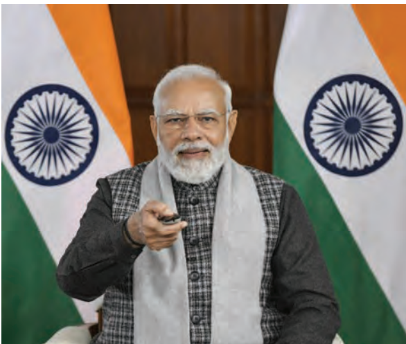
PM Narendra Modi at the distribution ceremony of 71,000 appointment letters under Rozgar Mela via video conferencing on Friday

understand its benefits. This has opened a new area of entrepreneurship by providing online services in villages," Modi said. According to the Prime Minister, flourishing start up scene in tier 2 and tier 3 cities has created a new identity for the youth in the world. The PMO had earlier said the 'Rozgar Mela' is a step towards fulfilment of Modi's commitment to accord highest priority to employment generation.