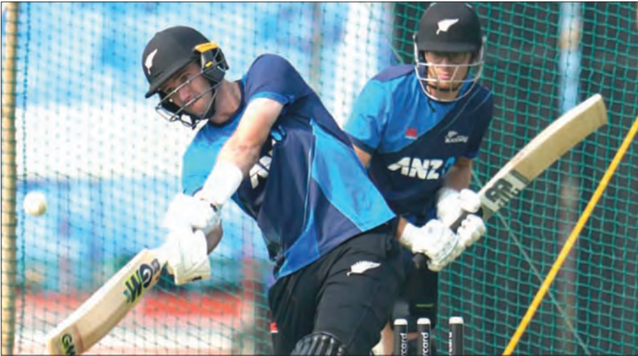
Mitchell Santner practies vicariously as he watches Henry Shipley

RAIPUR, JAN 20 /--/ New Zealand left-arm spinner Mitchell Santner feels getting more opportunities to bat over the past 12 months has led to an improvement in his power game and helped him chip in with useful knocks. Santner smashed his third ODI fifty on Wednesday while supporting a rampaging Michael Bracewell in a whirlwind 162-run stand for the seventh wicket against India, taking New Zealand very close to the finishing line in Hyderabad. Batting at number eight, his game plan is simple – to hit sixes from ball one – and that was amply clear in the way he batted in the centre nets of Shaheed Veer Narayan Singh Stadium here on Friday. Like the rest of the New Zealand batters, he mostly faced the spinners and tried to hit most balls out of the park. "Being an all-rounder you need to chip in both the departments. In the last year or so, getting more opportunities to bat has helped. It can be quite challenging at times