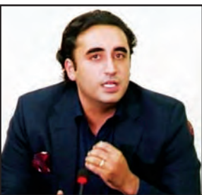
Bilawal Bhutto Zardari

DAVOS, JAN 20 /--/ The existing international order was created keeping in mind interests of the West and the world needs a new one where voice of the Global South can be heard, Pakistan's foreign affairs minister Bilawal Bhutto Zardari said on Friday. Speaking at a session during the World Economic Forum Annual Meeting 2023 here, he also favoured peace negotiations to resolve the Ukraine crisis.