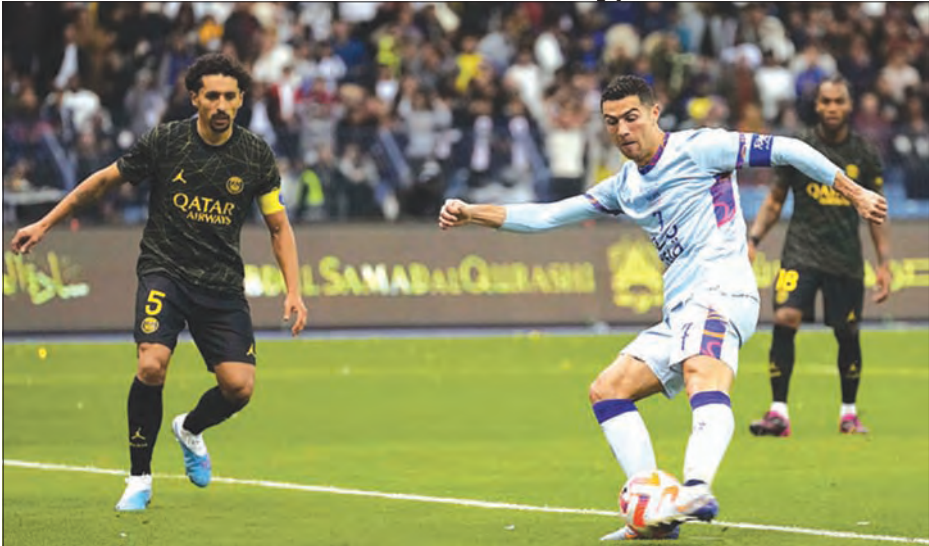
Ronaldo (C) shoots to score his team's second goal during the Riyadh Season Cup football match

RIYADH, JAN 20 /--/ Grimacing in pain from his bruised cheekbone, Cristiano Ronaldo steadied himself before scoring from the penalty spot for his first goal in Saudi Arabia against a Paris Saint-Germain team featuring old foe Lionel Messi. Messi had already scored early in Thursday's exhibition game when Ronaldo was flattened boxing-match style by PSG goalkeeper Keylor Navas after about 30 minutes in Riyadh, the city which gained sporting prominence for hosting a world heavyweight championship boxing bout in 2019. It wasn't Anthony Joshua but Navas who caught Ronaldo flush in the face with his forearm under a high ball. Both went down like felled boxers. Ronaldo held his head, got back up, did a wide yawn as if to test his sore left cheek, and sent his former Real Madrid teammate Navas the wrong way. By the end of the first half Ronaldo's cheekbone was bright apple red but he was all smiles after netting his second goal, smashing in a rebound when his header came back off the post. Poking his tongue out, Ronaldo wheeled away in delight and was mobbed by teammates at the corner flag.