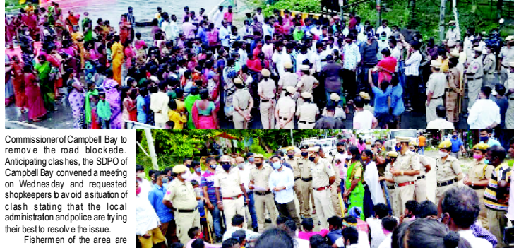
Commissioner of Campbell Bay to remove the road blockade. Anticipating clashes, the SDO of Campbell Bay convened a meeting on Wednesday and requested shopkeepers to avoid agitation of clash stating that the local administration and police are trying their best to resolve the issue. Fishermen of the area are

Port Blair, Nov 10: The agitation by the fishermen community in Campbell Bay entered its third day on Wednesday with the members of the community demanding a ban on big fishing trawlers in the region. The fishermen community has been staging a protest blocking the roads in Campbell Bay to press for their demands. Due to road blockade by the fishermen, traffic movement has been completely halted and commuters are facing a tough time reaching their offices on time. While the agitators have blocked the road from three sides not permitting movement of public transport vehicles forcing office-goers to go by foot for work, shopkeepers and general public of the area served an ultimatum to the Assistant