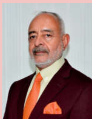
(Admiral D K Joshi)

My heartiest wishes for the "World Veterinary Day" celebrations.