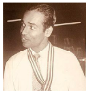
game