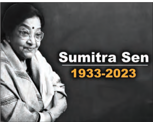
Sumitra Sen 1933-2023

Chief minister Mamata Banerjee condoled the demise of Sen, saying her death is an irreparable loss for the music world. "I am deeply saddened by the sudden demise of Sumitra Sen, who had enthralled the audience for decades. I had a close relationship with her for a long time. The West Bengal government had awarded her 'Sangeet Mahasamman' in