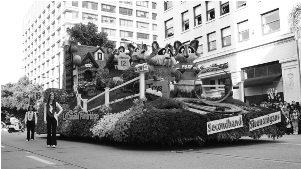
A float moves along Colorado Boulevard during the 134th Rose Parade in Pasadena, California, United States