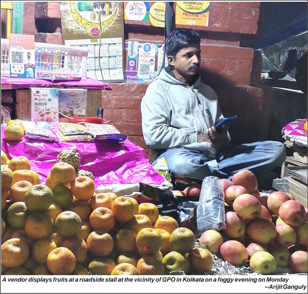
A vendor displays fruits at a roadside stall at the vicinity of GPO in Kolkata on a foggy evening on Monday

It's true. Masses of working and marginalized people in Peru are themselves prepared, as indicated by their surprise vote for Castillo in 2021 and currently by their vigorous and ongoing resistance to the coup. Now as in the past, they are waiting for visionary and revolutionary leadership. (IPA)