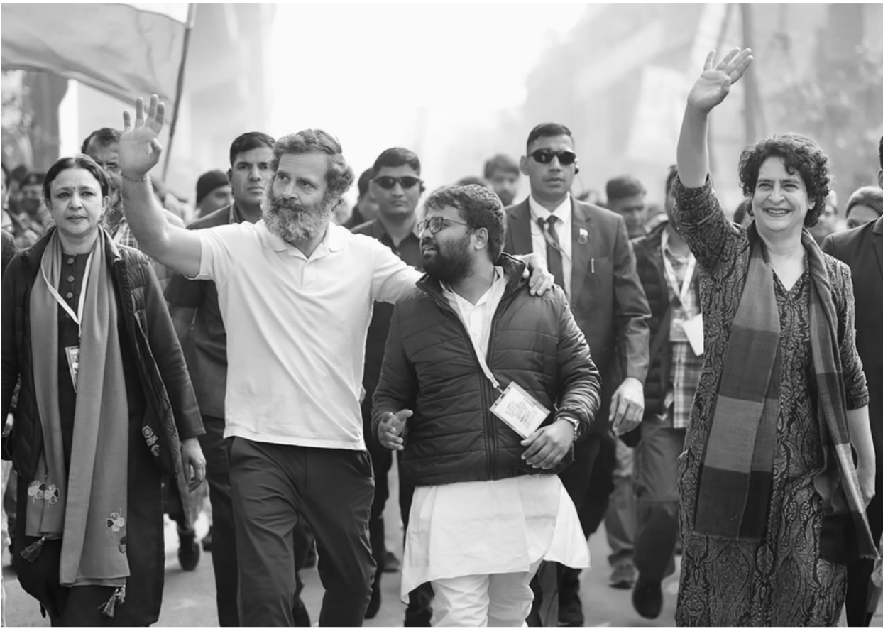
Congress leader Rahul Gandhi and his sister Priyanka Gandhi Vadra waving at supporters during the second leg of Bharat Jodo Yatra in New Delhi on Tuesday