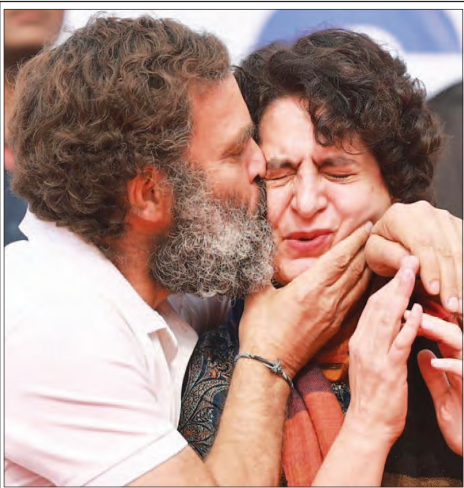
An affectionate moment of Congress leaders Rahul Gandhi and Priyanka Gandhi Vadra at the start of UP leg of party's 'Bharat Jodo Yatra', in Ghaziabad

GHAZIABAD, JAN 3 /--/ The brother-sister duo of Rahul Gandhi and Priyanka Gandhi Vadra shared some affectionate moments during the Bharat Jodo Yatra after it entered Uttar Pradesh on Tuesday. As Priyanka Vadra called her elder brother a "warrior" who was wearing the "shield of truth" and was not afraid of anyone, Rahul Gandhi affectionately hugged her and even kissed her on the cheek during the flag handing-over ceremony at the Loni border. They later walked hand in hand during the yatra in Uttar Pradesh, often waving to the ecstatic crowds who welcomed their leaders with enthusiasm. Rahul Gandhi also swung his arm around his sister while walking in Uttar Pradesh's Baghpat while displaying the bonding between them, amid cheering crowds. A large number of people welcomed the two Gandhi siblings along the path in Uttar Pradesh, where the yatra will be till January 5 evening before entering Haryana. (PTI)