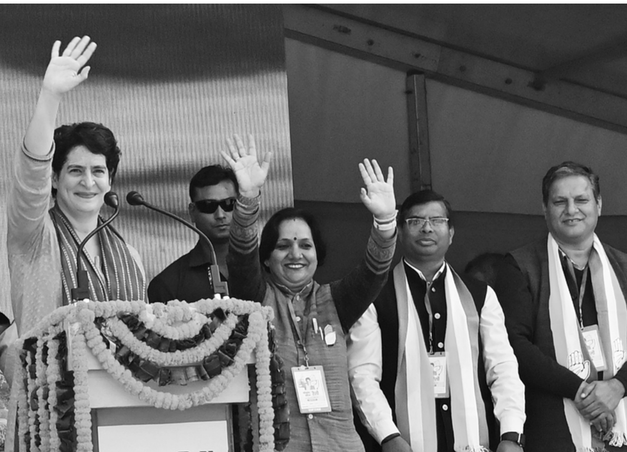
AICC General Secretary Priyanka Gandhi Vadara gestures to the Congress workers during the Congress party's 'Privartan Pratigya Rally', in Mandi

post should be wound up, he said and added that those who criticised the Centre were branded as 'urban Naxalites', terrorists, Maoists and anti-nationals, he said. The veteran leader appealed to all like-minded secular political parties to unite and dislodge the BJP government at the Centre in the 2024 Lok Sabha elections to protect the Constitution, democracy and state rights. "Just like how the Secular Progressive Alliance is working in Tamil Nadu, secular parties, Left parties and social organisations should work together in other states to overthrow the fascist regime," Raja said. He congratulated Brazil's Lula da Silva, who emerged as the country's new president defeating Jair Bolsonaro, and said people there realised that policies of the Left parties are better and voted accordingly. (PTI)