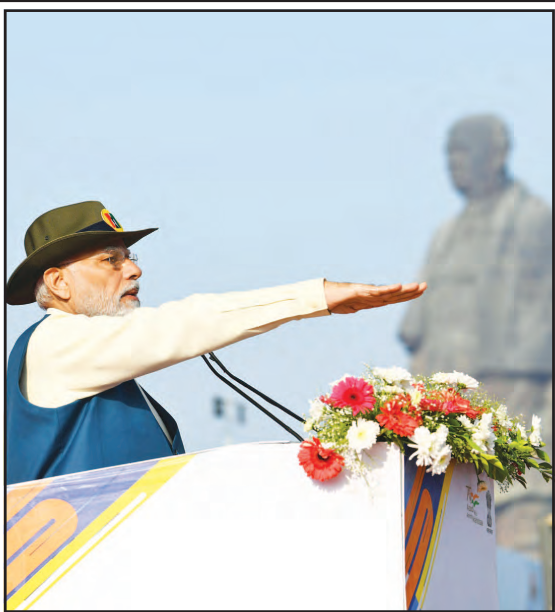
Prime Minister Narendra Modi administering pledge at the Rashtriya Ekta Diwas celebrations, in Kevadia, Gujarat on Monday

It is difficult to imagine the situation if India's integration was not led by leaders like Sardar Patel. What would have happened if more than 550 princely states were not amalgamated, the Prime Minister said. "If our princely states would have not shown a deep sense of sacrifice and faith in Maa Bharati and decided not to join us, what would have happened? This impossible task was completed by Sardar Patel," he added. Modi said Sardar Patel's Jayanti and the Ekta Diwas are not merely dates on the calendar for us, they are a grand celebrations of India's cultural strength. (PTI)