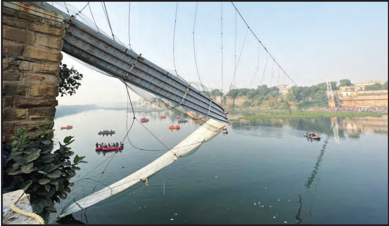
Rescuers search for survivors after a suspension bridge collapsed in Morbi town in the western state of Gujarat

MORBI, OCT 31 /--/ Police on Monday arrested nine persons, including four from the Oreva group that was managing the Morbi suspension bridge, and filed a case against firms tasked with maintenance and operation of the British era structure which collapsed, killing 134 people.