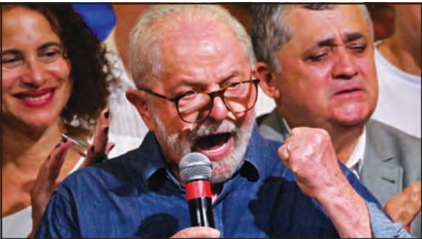
Lula da Silva

"The huge challenge that Lula has will be to pacify the country," he said. "People are not only