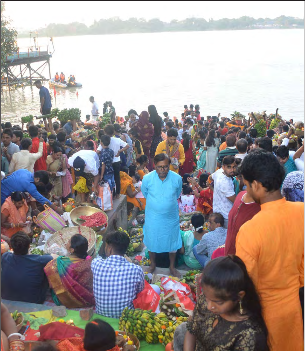
Devotees throng Dahighat to offer prayers & take a holy dip on the occasion of Chhatt Puja on Sunday