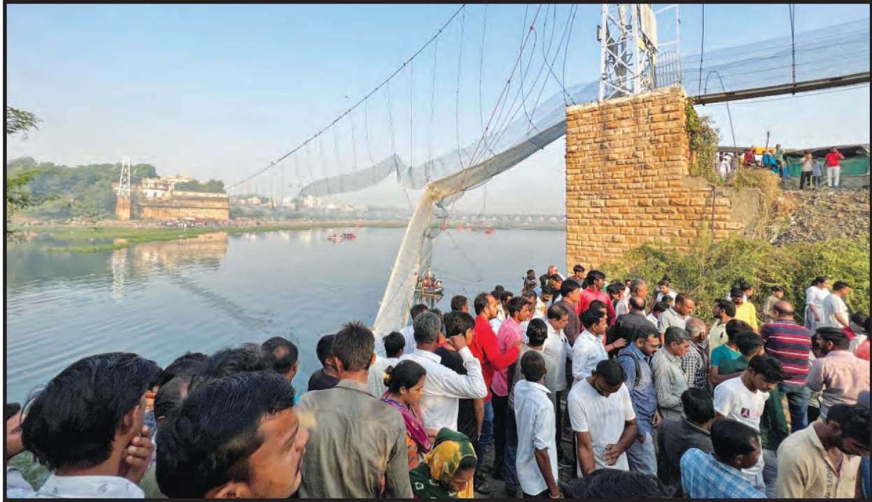
Day after tragedy, people gather as rescuers search for survivors at the site where the suspension bridge collapsed in Gujarat's Morbi