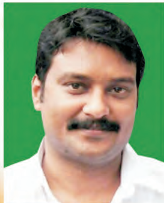
Kuldeep Rai Sharma Member of Parliament, A & N Islands

presentation of awards, Lt Governor will address the Islanders. Before arriving at the main function, the Lt Governor will visit National Memorial Cellular Jail and place a wreath at the 'Martyr's Column' there. The main attraction of the Republic Day is the march past in which the contingents of Defence Forces, Police, NCC, School (Boys & Girls) will participate. Cultural programmes by school children will add grandeur to the Republic Day function at Marina Park road which will conclude with the National Anthem. The people of the islands are happy that the Republic Day ceremony is held at Marina Park road after a long gap. It was during the tenure of former Lt Governor, Mr. Vakkam Purushothaman, the venue of the Republic Day parade was shifted from Marina Park to Netaji Stadium. In the afternoon, 'At Home' will be held at Raj Niwas for special invitees.