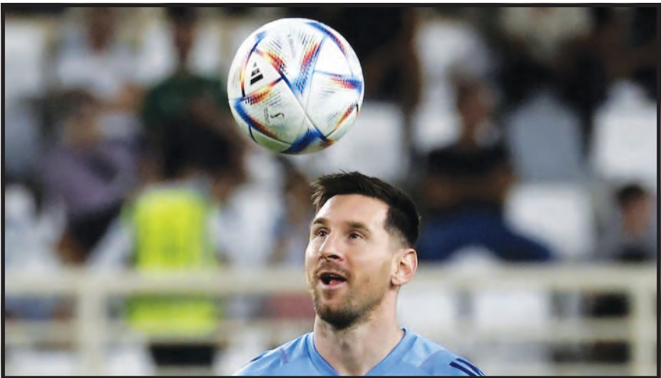
Lionel Messi controls a ball during a training camp in Abu Dhabi

DOHA, NOV 15 --/ Lionel Messi says he is cautious over Argentina's chances as he prepares to lead the team at the World Cup, seeking to crown a glorious career by lifting the trophy in Qatar. The South American side have won the trophy twice -- in 1978 and 1986 -- with Messi a defeated finalist in 2014. "We are very excited," Messi said in an interview with CONMEBOL, the South American football federation. "We have a very nice group that is very eager, but we think about going little by little. We know that World Cup groups are not easy." Argentina's opening match at the World Cup is on November 22 against Saudi Arabia in Group C, which also includes Mexico and Poland.