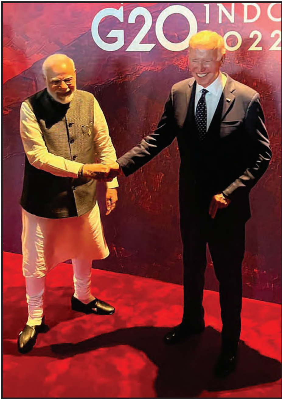
Prime Minister Narendra Modi meeting US President Joe Biden at the G20 Summit in Bali (Indonesia) on Tuesday

sidelines of G20 Bali Summit. Leaders appreciated the continuing deepening of India-US Strategic Partnership & close cooperation in groups like Quad, I2U2, etc. Agreed to maintain close coordination during #G20India," he tweeted. Modi and Biden held the conversation days after external affairs minister S Jaishankar met US Secretary of State Antony Blinken on the sidelines of the ASEAN-India Summit in the Cambodian capital of Phnom Penh. Jaishankar and Blinken discussed a range of issues including bilateral ties, the Ukraine conflict and the situation in the Indo-Pacific among others. Since the Ukraine conflict began in February, Prime Minister Modi spoke to Russian President Vladimir Putin as well as Ukrainian President Volodymyr Zelenskyy a number of times. In a phone conversation with Zelenskyy on October 4, Modi said that there can be "no military solution" and that India is ready to contribute to any peace efforts. In his meeting with Russian President Putin in the Uzbek city of Samarkand in September, Modi conveyed to him that "today's era is not of war". India has not yet condemned the Russian invasion of Ukraine and it has been maintaining that the crisis must be resolved through diplomacy and dialogue. (PTI)