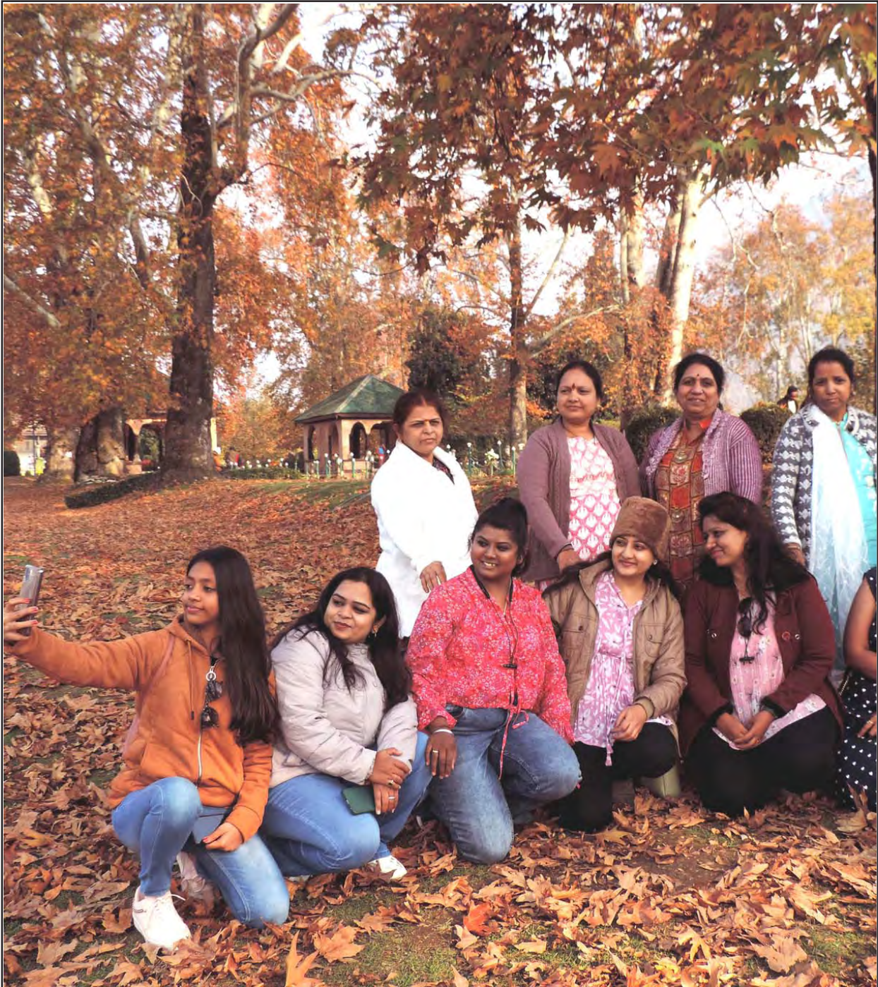
A group of tourist click a selfie at Mughal Garden Shalimar in Srinagar enjoying Autumn in Kashmir on Tuesday

The wish list from CJI Dr. Chandrachud is long and lengthy. But above all, I look forward to seeing a commitment to liberty, a restoration of eroded secular values, and a check on majoritarianism and an anti-Constitutional concentration of power in the hands of the Executive. (IPA)