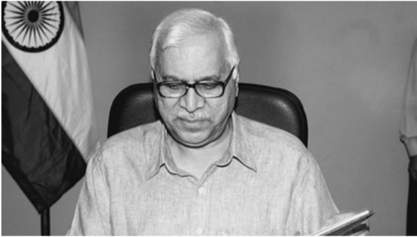
S Y Quraishi

NEW DELHI, DEC 29 -- / Former Chief Election Commissioner S Y Quraishi on Thursday described as an "excellent initiative" the decision of the Election Commission to invite political parties for a demonstration of a prototype of remote electronic voting machine for domestic migrant voters. Quraishi also welcomed the move of the poll panel to carry out a pilot, saying it will help smoothen difficulties faced by the system. In a major move to increase voter participation, the Election Commission on Thursday said it has developed a prototype of a remote electronic voting machine (RVM) for domestic migrant