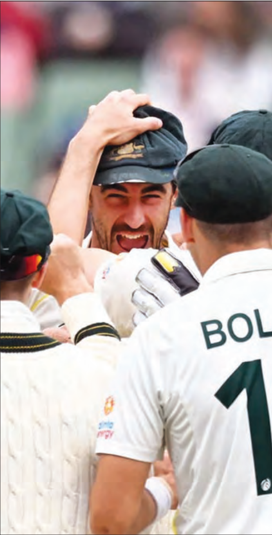
Australia celebrates the wicket of Sarel Erwee

MELBOURNE, Dec 29 /--/ Spinner Nathan Lyon took 3-58 as Australia bowled out South Africa for 204 Thursday to claim victory by an innings and 182 runs on the fourth day of the second test at the Melbourne Cricket Ground. Australia clinched the series and will be chasing a 3-0 sweep in Sydney where the third and final test starts on Jan.4. Tamba Bavuma top-scored for South Africa with 65, although he also played key roles in two run outs. Resuming Thursday on 15-1, South Africa lost three wickets in the morning session. Mitchell Starc, nursing a tendon injury to the blood-stained middle finger on his bowling hand, produced a fast yorker to remove Sarel Erwee lbw for 21 at 47-2. Ten runs later, Scott Boland had Theunis de Bruyn (28) caught at second slip as cracks continued to appear in the Proteas' brittle batting lineup. Those cracks widened when Khaya Zondo was run out in demoralizing fashion for one at 65-4 after Bavuma pushed to mid-off and called Zondo through for a risky single. Bavuma and Kyle Verreynne (33) fought hard to add 63 for the fourth wicket before Boland (2-49) removed Verreynne lbw at 128-5 in the fourth over after lunch. Marco Jansen (five) fell in the same fashion to spinner Nathan Lyon 16 runs later, following a video review. Bavuma was involved in a