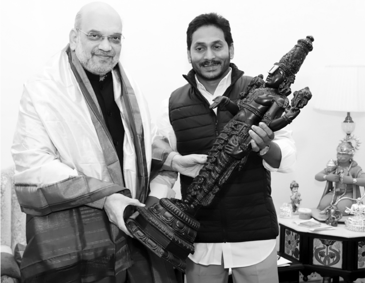
Andhra Pradesh Chief Minister Y S Jagan Mohan Reddy calling on Union Home Minister Amit Shah, in New Delhi on Thursday

works, Artificial intelligence and other areas. More women need to come forward to take up science streams, the President emphasised. Murmu said STEM-- Science, Technology, Engineering and Mathematics -- is vital to the Indian economy. Nurturing young women as technocrats and innovators can lead the country towards a stronger economy. Women bring different perspective and skill-sets in tech fields. Cognitive abilities of women can change the way knowledge and technologies are perceived at various levels, she said. Women should overcome challenges that come their way and rise in their careers, she added. The President advised students to be empowered and empower others too. She said they should not be satisfied just with their own success and happiness. They have a duty towards the nation and humanity as a whole. They should use their talent and technological capabilities for the larger good. (PTI)