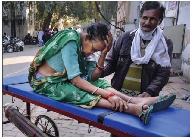
An elderly patient with breathing problems waits for admission to the Lala Lajpat Rai Hospital amid COVID scare, in Kanpur

representatives of pharma companies through a virtual conference here so that India is equipped to effectively handle any situation. This review meeting was taken in view of the spike in Covid-19 cases in some countries including China, an official statement said. Through a presentation, the minister was briefed regarding the evolving global scenario. Mandaviya appreciated the pharma companies for their invaluable contribution during the pandemic in the country, the statement said. According to the Union health ministry data on Thursday, India recorded 268 new coronavirus infections, while the active cases increased to 3,552. The daily positivity rate was recorded at 0.11 per cent while the weekly positivity was pegged at 0.17 per cent, the ministry said. (PTI)