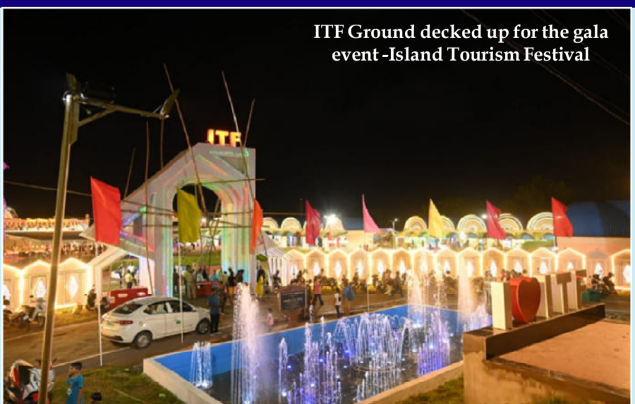
ITF Ground decked up for the gala event -Island Tourism Festival

The ITF Ground at VIP Road is all set to come alive with pomp and show as the five days gala event- Island Tourism Festival -2023 being organized by A&N Administration is set to begin tomorrow (Dec.27). Hon'ble Lt. Governor, A&N Islands & Vice Chairman, Islands Development Agency, Admiral DK Joshi, PVSM, AVSM, YSM, NM, VSM (Retd.) as the chief guest will inaugurate the festival at the ITF