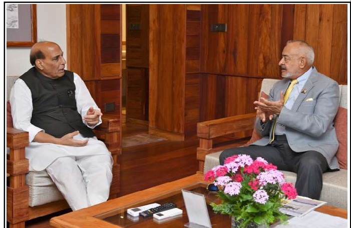
Jan 5: On departure from Port Blair, Hon'ble Raksha Mantri Shri Rajnath Singh was given a fond send off by RajNiwas staff & Admiral D K Joshi, PVSM, AVSM, YSM, NM, VSM (Retd.), Hon'ble Lt Governor, A&N Islands and Vice-Chairman, Islands Development Agency alongwith senior Officers of Andaman & Nicobar Administration and Andaman & Nicobar Police at VSI Airport.