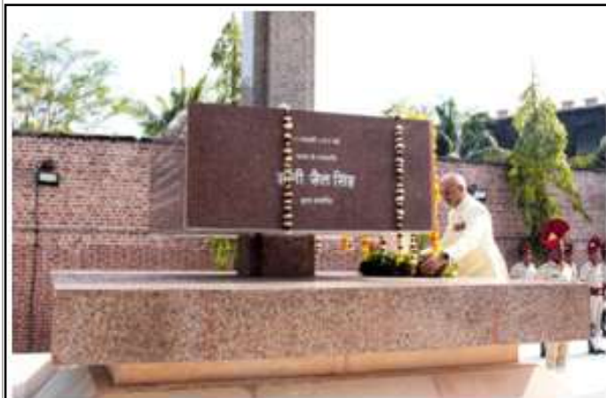
On the occasion of 74th Republic Day, Admiral D K Joshi, PVSM, AVSM, YSM, NM, VSM (Retd.), Hon'ble Lt Governor, A&N Islands and Vice Chairman, Islands Development Agency paid homage to the great freedom fighters at Martyr's Column, National Memorial Cellular Jail.

A weekly echoing the mood of the people, comes to you on every Monday