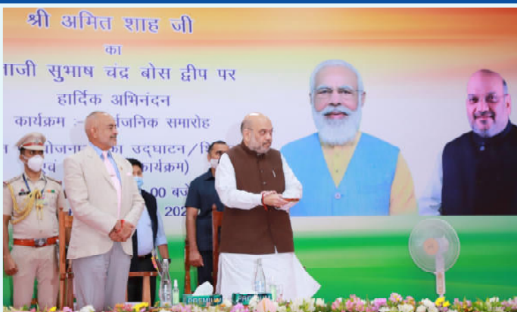
Hon'ble Home Minister, Shri Amit Shah during his visit to Netaji Subhas Chandra Bose Island on 16.10.2021. (File Photo)

The efforts made by the A&N Administration on this count fructified with the Home Ministry accepting the proposal and the Administration taking over the administrative control of the NSCB Island today. This could be possible due to the support of the Hon'ble Home Minister,