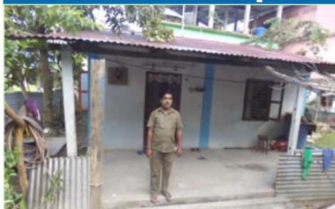
Port Blair, May 26

The Pradhan Mantri Awas Yojana (Urban) Mission which was launched on 25th June, 2015 aims to provide 'Housing for All' in urban areas by year