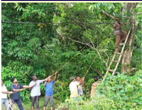
Port Blair, May 26

Incidents of damage to electricity lines & theft of electricity to be viewed seriously; strict action to be taken as per penal provisions