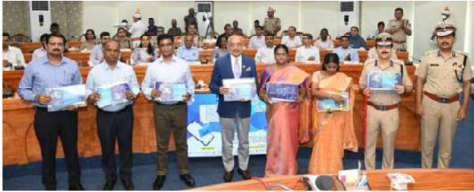
Port Blair, Oct 06: The first National Dolphin Day was celebrated across Andaman (See page 4)