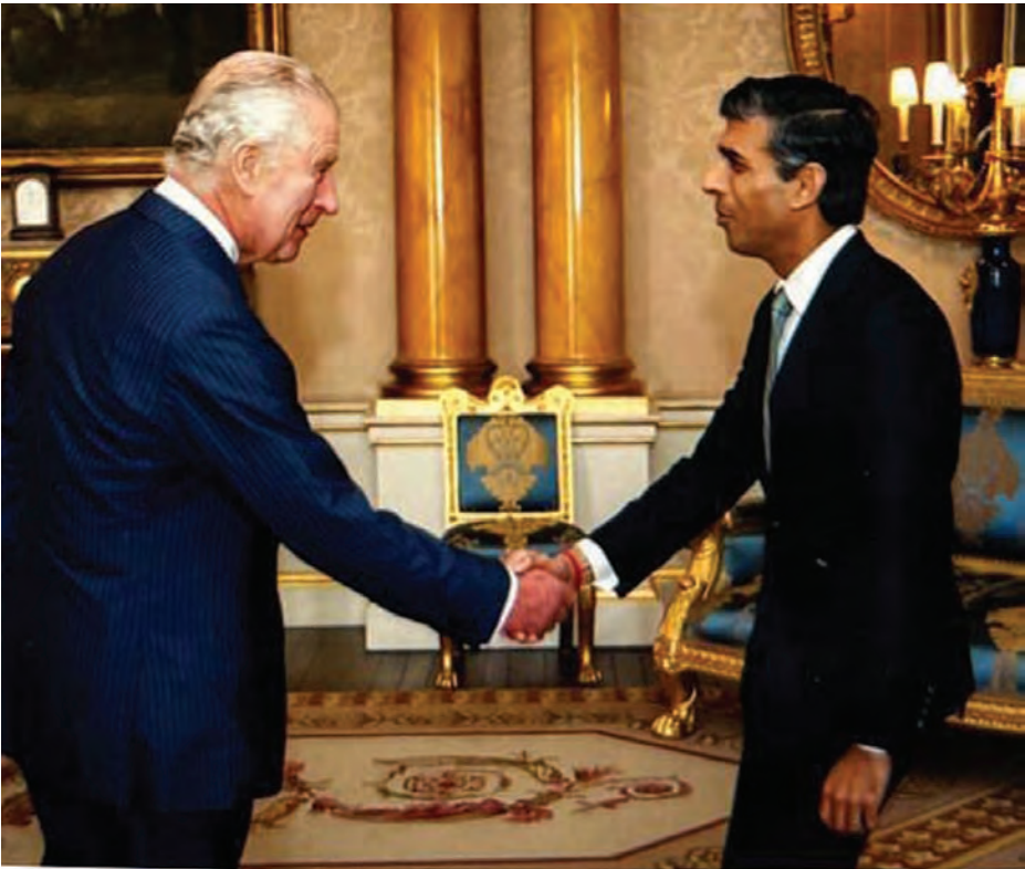
Rishi Sunak (R) with king Charles III at Buckingham Palace