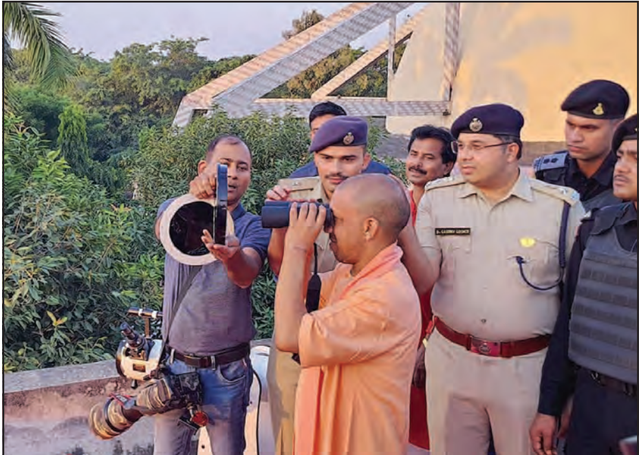
UP CM Yogi Adityanath watches the partial solar eclipse through a telescope at Veer Bahadur Singh Planetarium in Gorakhpur on Tuesday

Sciences, Naintal and Inter-University Centre for Astronomy and Astrophysics, Pune had set up live streams on YouTube from the sites of their telescopes to view the eclipse. Thousands of devotees in various parts of the country took a holy dip in rivers and lakes. In Haridwar, devotees gathered to offer prayers at Har Ki Pauri ghat on the banks of Ganga. In Haryana, people thronged the Brahma Sarovar, Sannihit Sarovar, Jyotisar Tirtha, Pehowa Tirtha and other sites of the Kurukshetra, the land of Mahabharata. According to Hindu beliefs, a bath in the holy tanks at Kurukshetra during a solar eclipse is considered auspicious. Many important temples remained closed. In Telangana, Sri Lakshmi Narasimha Swamy temple in Yadagirigutta, Sri Raja Rajeshwara Swamy temple in Vemulawada, Lakshmi Narasimha Swamy Temple in Dharmapuri and Sri Gnana Saraswathi Devi temple in Basar are among those remain closed. (PTI)