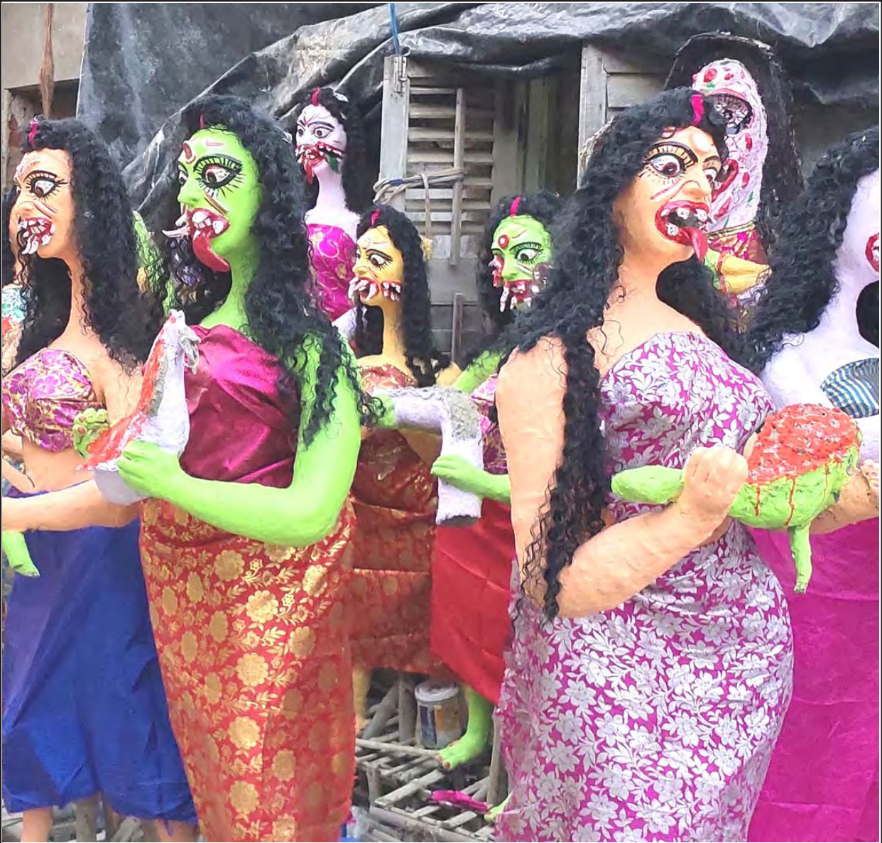
Unsold demon figurines lay on roadside to be stored for use next year

India's rising trade deficit and continuing hot money outflow from the secondary market, courtesy foreign portfolio investors, are weakening RBI's forex reserves and INR's exchange value. While the government and RBI can do little to bring FPIs back in the midst of the global financial turmoil, it can certainly contain avoidable imports such as gold, precious metals, cheap electronics and other luxury products for consumption of the rich. It may be time to focus on the much neglected 'Make-in-India' initiative while expanding bilateral Rupee trade and currency swap to arrest the fall of INR and stabilise the economy. (IPA)