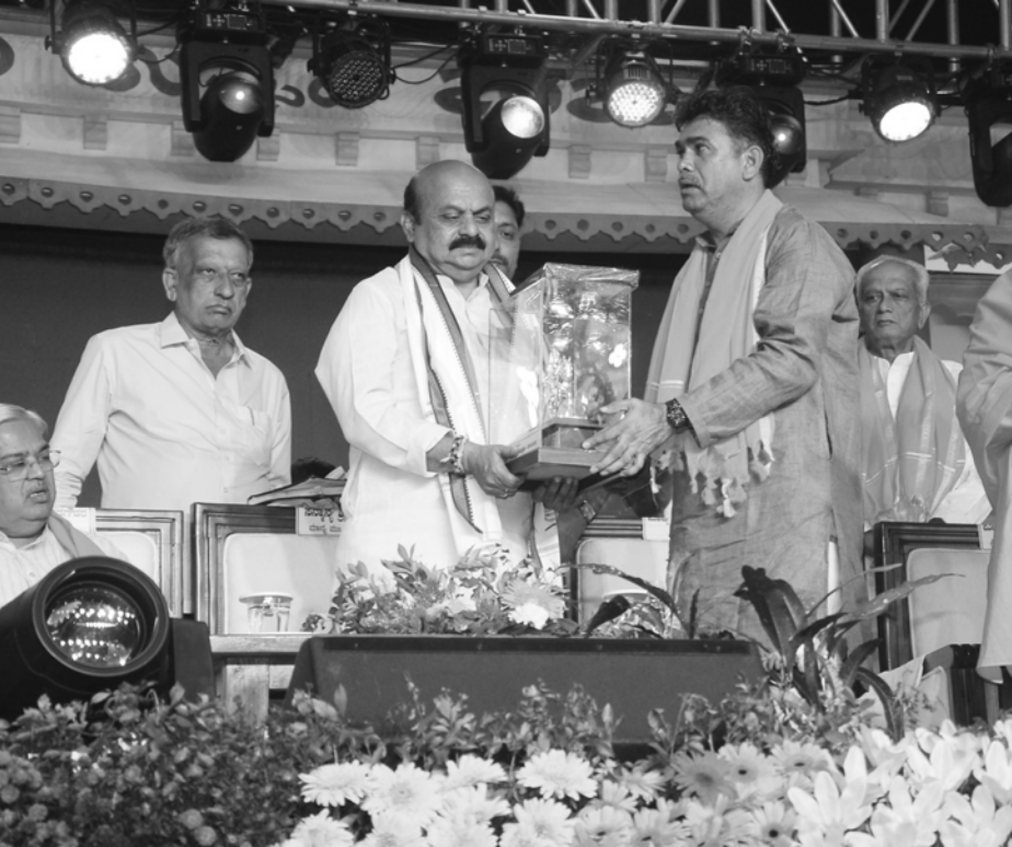
Karnataka Chief Minister Basavaraj Bommai during the inauguration of 'Kitturu Utsav-2022' in Belagavi

Delhi had recorded an AQI of 382 on Diwali last year, 414 in 2020, 337 in 2019, 319 in 2017, and 431 in 2016, according to Central Pollution Control Board data. It recorded a 24-hour average AQI of 312 at 4 pm on Monday -- the second best for Diwali day in seven years. Before this, the city recorded an AQI of 281 on Diwali in 2018. (PTI).