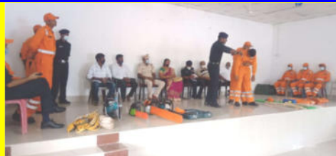
National Disaster Response Force in Action at various location in ANI