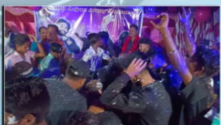
BIRTHDAY CELEBRATION ON 08.04.2022

Port Blair, April 20: Our Allu Arjun Army Andaman organized various good social activities in Andaman on the occasion of Birthday Celebration of Tollywood Stylish Star Allu Arjun.