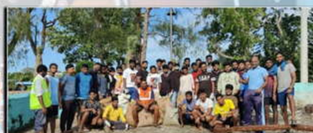
CLEANLINESS DRIVE ON 06.04.2022