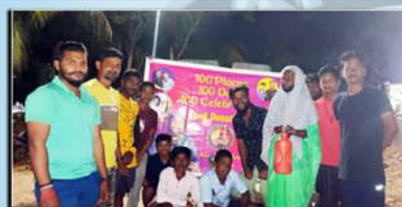
DISTRIBUTION RATION KITS ON 30.01.2022