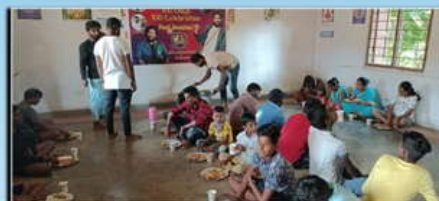
FOOD DISTRIBUTION ON 23.01.2022