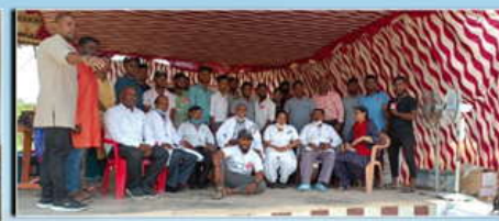
BLOOD DONATION CAMP ON 02.04.2022