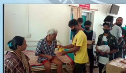
DISTRIBUTION OF FOOD ITEMS TO MEDICAL PATIENTS ON 20.02.2022