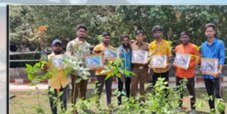
PLANTATION ON 04.04.2022