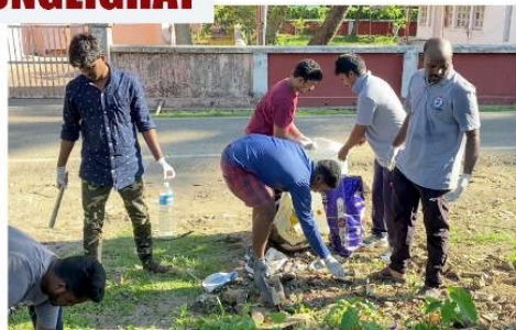
Shaheed Captain Ashim Kumar Battacharya Park, Junglighat