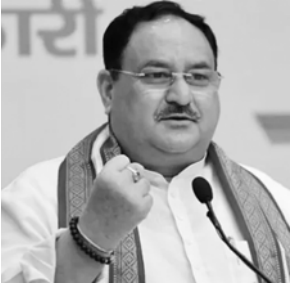
J P Nadda

NEW DELHI, JAN 17 /--/ BJP president J P Nadda's term was extended till June next year at the party's national executive meeting on Tuesday, with Union home minister Amit Shah asserting that it will win the 2024 Lok Sabha polls with a bigger mandate than 2019. The widely expected development underlines the party's preference for continuity as it gears up for the all-important Lok Sabha polls next year, expected in April-May. Shah told reporters here that defence minister Rajnath Singh, a former party president like him, moved the proposal of extending Nadda's tenure till June next year and the executive unanimously endorsed it. The BJP's parliamentary board has already approved the extension of Nadda's term as the party president. "I, on behalf of the party, express heartfelt gratitude to