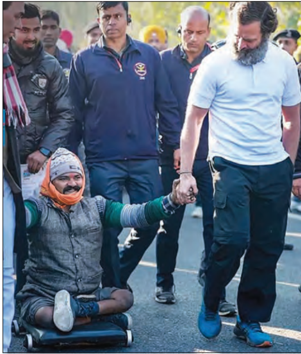
Congress leader Rahul Gandhi with a physically challenged supporter during the party's Bharat Jodo Yatra, in Hoshiarpur district, Punjab