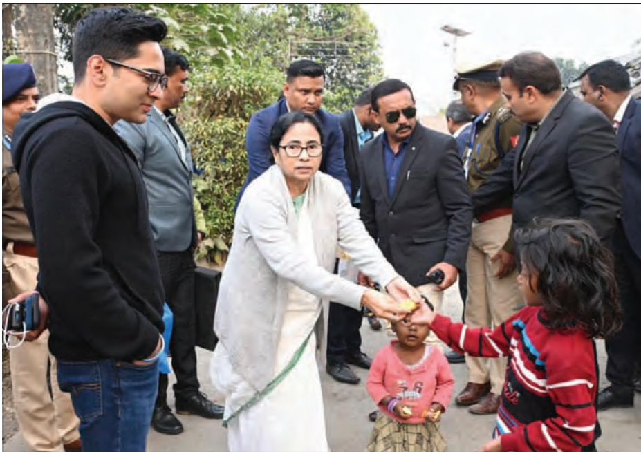
Chief Minister Mamata Banerjee offering candy to a local girl during her visit to Subhashini Tea Estate, in Alipurduar. TMC national general secretary Abhishek Banerjee is also seen. The CM distributed clothes among local people and interacted with them

could play an important role in bringing Pakistan and India together. New Delhi has maintained that Kashmir is a bilateral issue between India and Pakistan and no third country has a role in it. "The Union Territory of Jammu & Kashmir and the Union Territory of Ladakh are and always will be integral and inalienable parts of India. No other country has a locus standi to comment on the same," the ministry of external affairs has said previously. Sharif said the UAE was a second home for millions of Pakistanis, days after he visited the Gulf nation, which was aimed at securing fresh loans, ramping up bilateral cooperation and trade ties. He also lauded Saudi Arabia for being a "friendly and brotherly country." "Before Pakistan came into being, and was carved out of India, millions of Muslims had brotherly relations with Saudi Arabia and were visiting Makkah and Madina," he added. Last week, Pakistan's Foreign Office said it welcomed third-party mediation in the resolution of all outstanding issues with India, including Kashmir. (PTI)