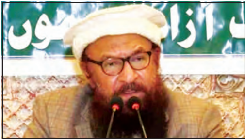
Abdul Rehman Makki

important international counterterrorism mechanism" and listing of terrorists or terror organisations under the aegis of the UN is conducive to enhancing international counterterrorism cooperation in response to terrorist threats, he said. India on Tuesday welcomed the UN Security Council decision to declare Makki as a global terrorist and said threats from terrorism in the region remain high and sanctions by the UNSC are an effective tool to curb such threats. External affairs ministry spokesman