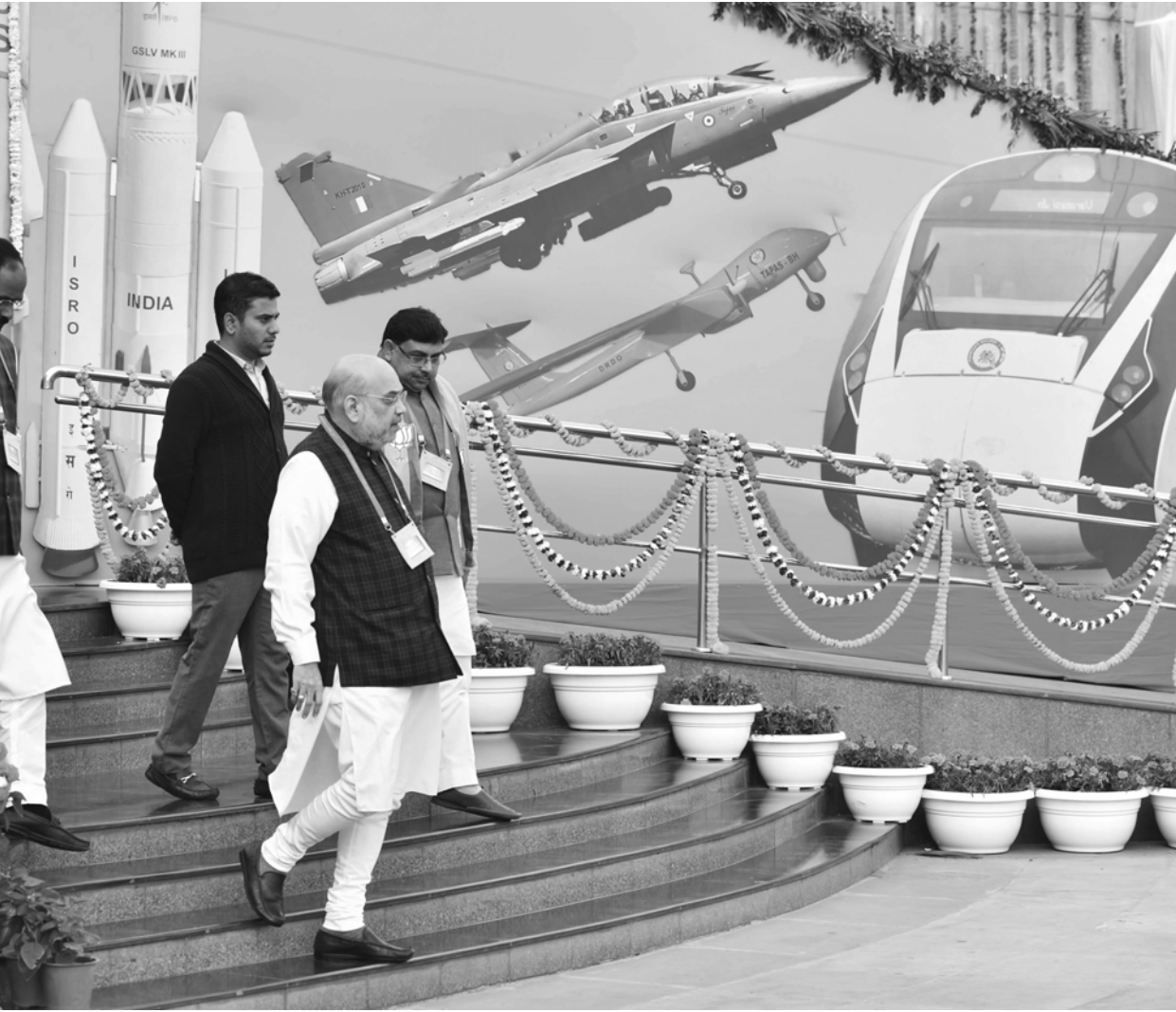
Union Home Minister and former BJP president Amit Shah at party's National Executive meeting, in New Delhi on Tuesday

again formed the government in Maharashtra and Haryana, he added. The BJP won Assembly polls in Assam, Manipur, Uttarakhand and Uttar Pradesh during Nadda's tenure as the party president, Shah said, adding that it also formed the government on its own for the first time in Goa. Talking about the recent victory in the Gujarat Assembly polls, Shah said: "Under Nadda's leadership, the BJP organisation converted Modi's magical leadership into votes and the party registered a record-breaking victory by winning 156 Assembly seats." He further said that the booth strengthening programme and the 'Vijay Sankalp Rally' are among the biggest takeaways of Nadda's leadership. Nadda had become the BJP president on January 20, 2020 for a term of three years. (PTI)