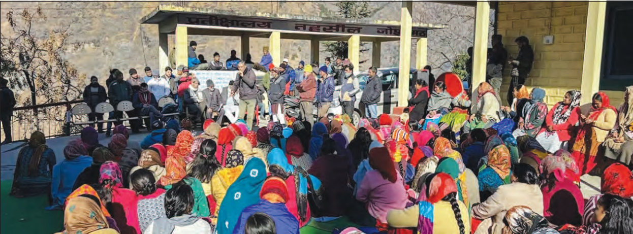
Locals take part in a protest against a thermal power project in landslide-hit Joshimath town of Chamoli. Many locals consider the project as a reason for recent land subsidence in the town