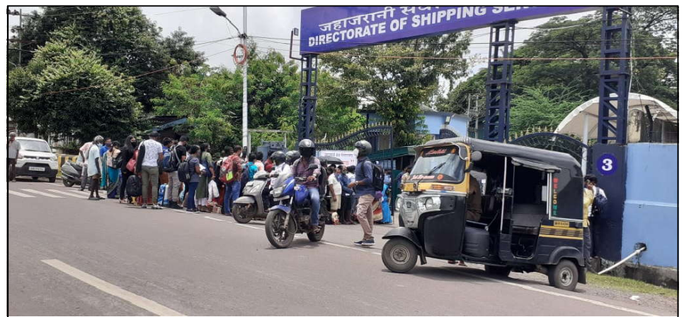
People standing in long queue outside DSS entry gate in the scorching Sun without following social distancing norm and other Covid protocols. They are ready to avail Boat service to Swaraj and Shaheed Dweep. This is the situation when there is a passenger Hall within DSS premise to accommodate most of the passengers