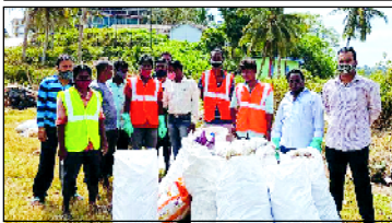
International human rights and crime control council had conducted a Swachh Bharat Abhiyan along with the staff & official of PBMC at Garacharma. The IHRCCC thanks the PBMC specially the sanitation team for their helping hands to clean the area

and members of CITU and other central trade unions also held demonstrations in support of the striking bank employees. The strike of the bank employees has also received international solidarity of the working class with the World Federation of Trade Unions issuing a statement in support of their struggle. CITU demands the Modi led BJP government to immediately stop bank privatisation and instead focus on strengthening the public sector banks.