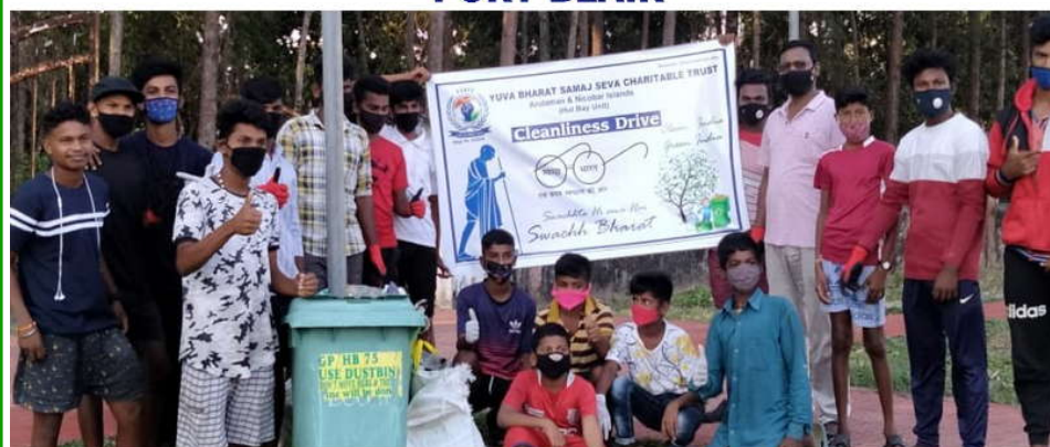
HUT BAY UNIT