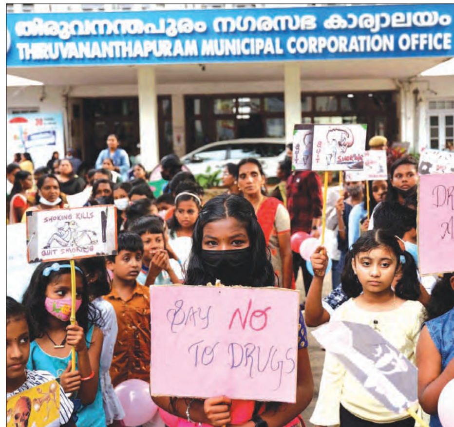
Children holding placard during the campaign against use of durg in front of Thiruvananthapuram corporation office on Sunday

The police said they could not find any traces of chicken pox on preliminary examination. They verified his name, address, and other details and let him off. (PTI)