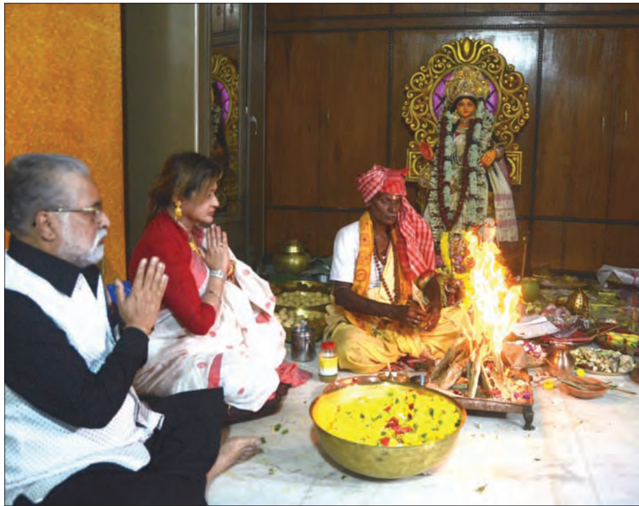
Trinamool Congress MP Sudip Bandyopadhyay and his MLA wife Nayna Bandyopadhyay offering prayers to Goddess Lakshmi on the occasion of Laxmi Puja at their residence in Kolkata on Sunday

People of Gujarat made me win polls without looking at my caste: PM Modi