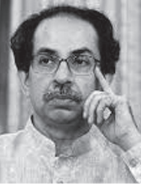
Rai Bachchan's famous poem "Agnipath.

We are on the side of the truth. Satyamev Jayate!" he said in the Marathi tweet. On his Instagram page, Aaditya posted Harivansh