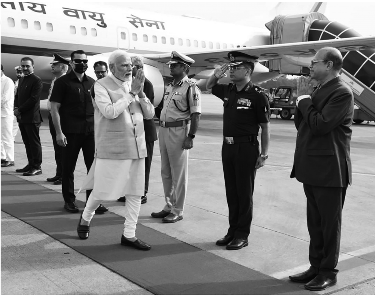
Prime Minister Narendra Modi being welcomed on his arrival at Ahmedabad airport on Sunday