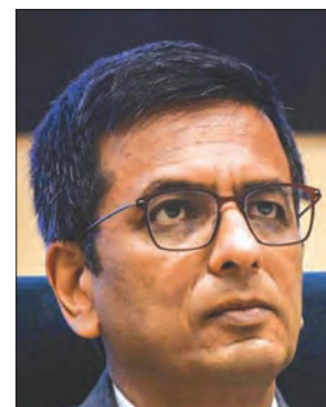
Justice DY Chandrachud