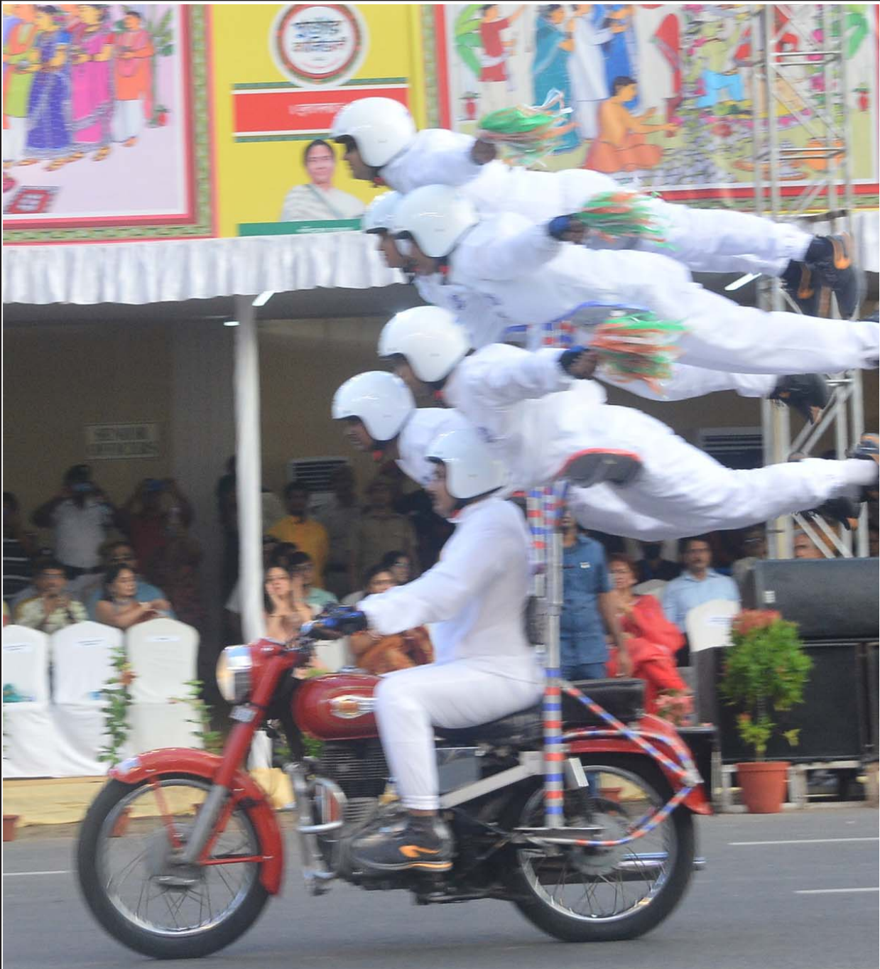
Kolkata Police personnel display acrobatic skills at the Durga Puja Carnival held at Red Road on Saturday

The Brazilian president is a big admirer of Trump. He supported what Trump did on January 6, 2021in Capitol Hill to undo the 2020 elections verdict by the American people. Even now, Trump is telling that the 2020 verdict was stolen by the Democrats. What Trump said after the elections results were out, Bolsonaro is repeating the same as the campaign in polarized Brazil is heating up leading to