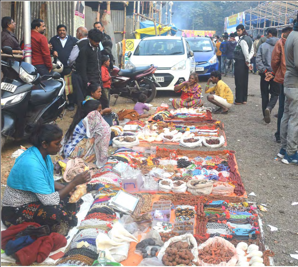
A typical scene of Gangasagar transit camp at Babughat

Fortunately, the party has a slogan to rival Prime Minister Narendra Modi's 'sabkasaath, sabkavikas' in Naveen Patnaik's 'asha, vishwas and swabhiman'. But where Chief Minister Patnaik scores over Prime Minister Narendra Modi is in the harnessing of women power. The BJD's focus on 'stree-shakti' is unparalleled and women are the ones who are keeping the BJD in power, and would for the next 100 years. The