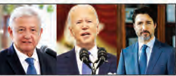
Andres Manuel Lopez Obrador, Joe Biden, Justin Trudeau

MEXICO CITY, JAN 10 /--/ President Joe Biden, Mexican President Andres Manuel Lopez Obrador and Canadian Prime Minister Justin Trudeau are meeting for a series of talks on migration, trade and climate change on Tuesday as the three leaders try to mend tensions that have divided the continent. The three-way gathering is held most years, although there was a hiatus while Donald Trump was US president. It's often called the "three amigos summit," a reference to the deep diplomatic and economic ties between the countries.