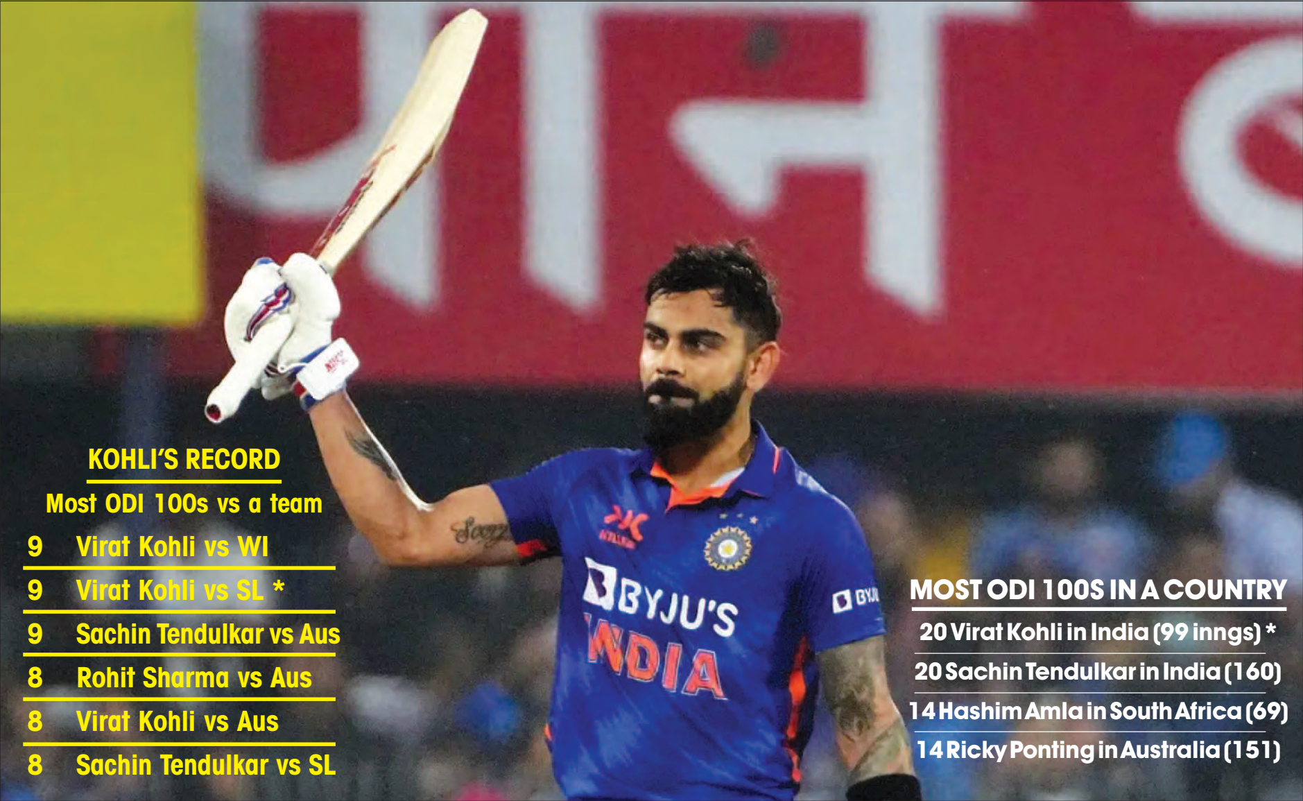
Virat Kohli celebrates his 45th ODI century