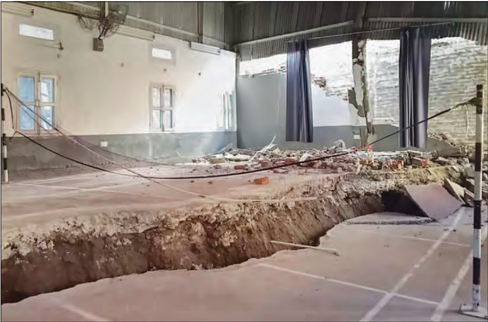
Cracks appear on the floor of an indoor badminton court in Joshimath area. The town has been declared a disaster-prone after large cracks appeared in homes and on roads