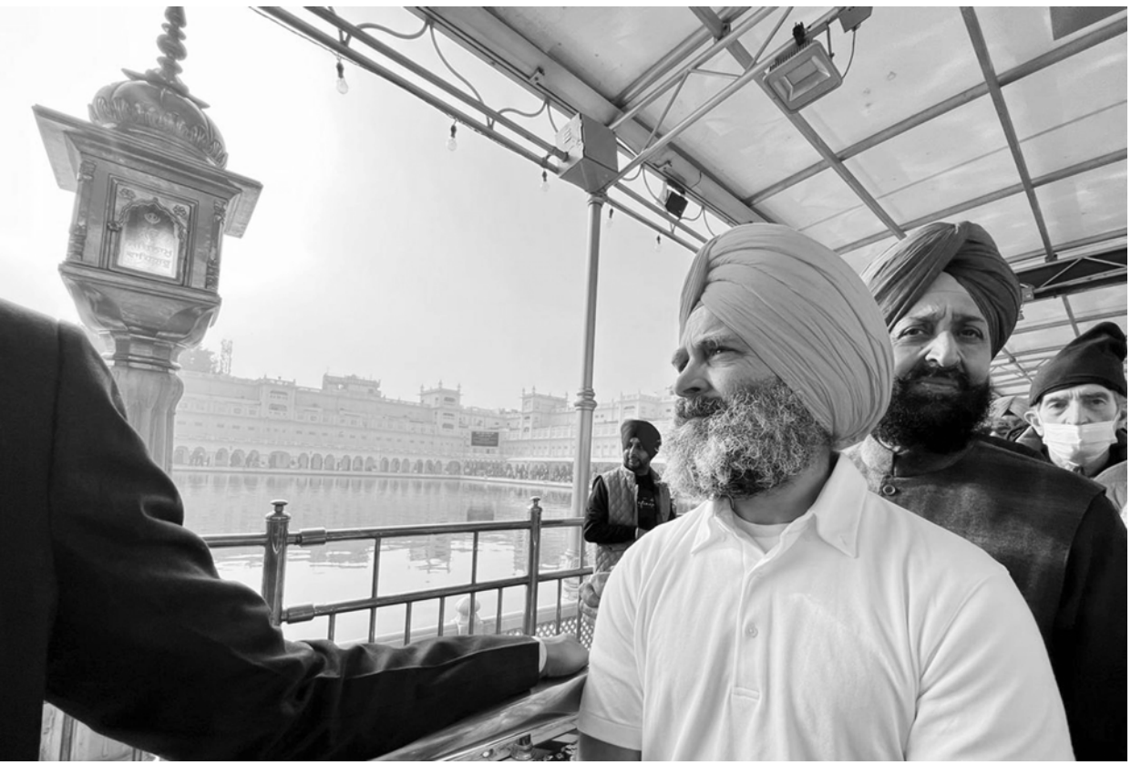
Congress leader Rahul Gandhi at Golden Temple in Amritsar ahead of party's 'Bharat Jodo Yatra' in Punjab

event, 'Team UP', which went to invite investors from the country and the world, has received investment proposals totaling more than Rs 12 lakh crore from the industry. The summit will help the state achieve its goal of becoming a USD 1 trillion economy by 2027," the statement quoted him as saying. Recently, some districts received investments worth thousands of crores by organising district investors' summits. Similar efforts should be made in all districts, he added. The chief minister also suggested that all MPs and MLAs should hold dialogue and maintain regular contact with entrepreneurs, businessmen and migrant people from their areas and