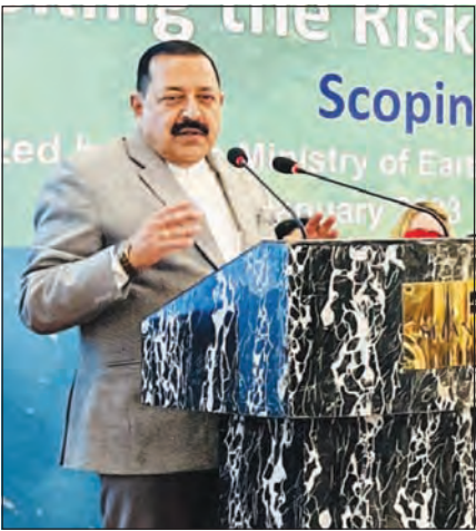
Union earth sciences minister Jitendra Singh

NEW DELHI, JAN 10 --/ The Centre on Tuesday announced that it will install micro seismic observation systems at Joshimath - the gradually sinking Himalayan town in Uttarakhand. Union earth sciences minister Jitendra Singh made the announcement at the India-UK Workshop of Geosciences here and said the observation systems will be in place by Wednesday. Addressing the workshop, he said there was a critical need for fundamental research on the physical processes that lead to failure of the brittle layers beneath the crust and sub-crust. The minister noted that human consequences of natural disasters in India were rising rapidly and stressed on the need to