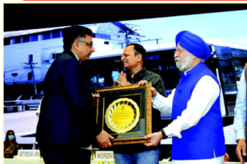
Port Blair, Oct.30