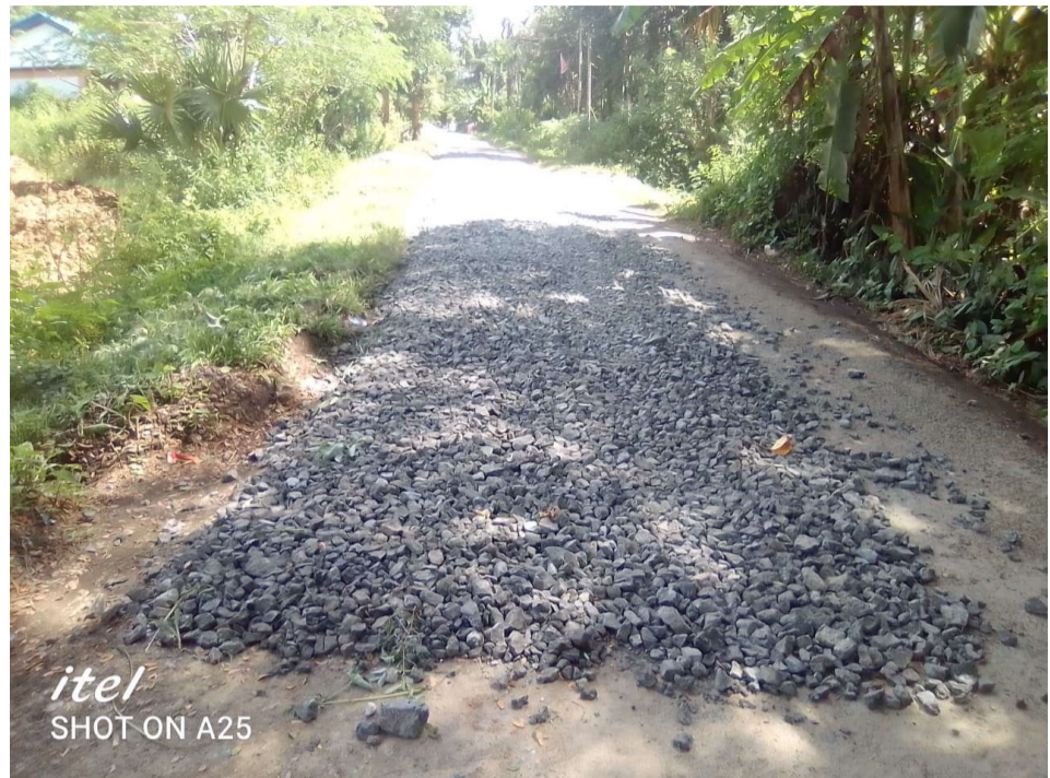
Port Blair, November 03 : The road in R K Gram village in Diglipur is in very bad shape. Currently metals are lying on this road. If road repair work is not taken up on priority there is every chance of this village road becoming an accident prone zone. More so for two wheelers.