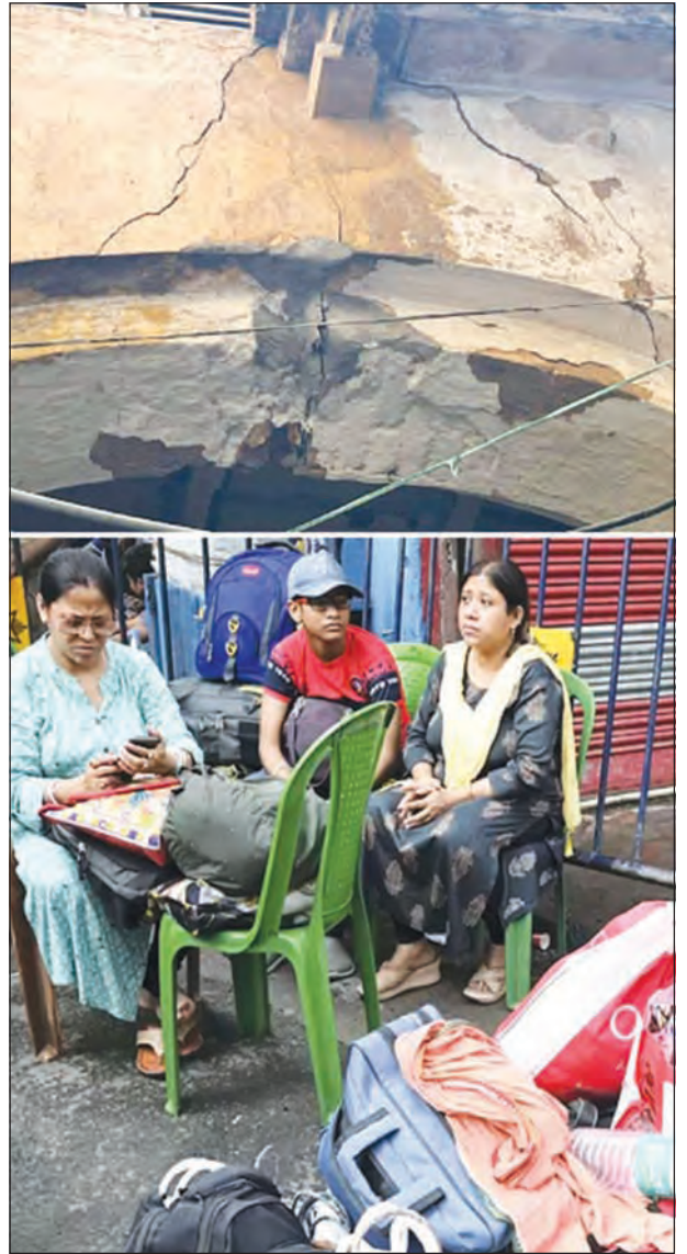
(Top to Bottom) Cracks that have developed on the house at Madan Dutta Lane. Residents with their belongings as they "evacuate Bowbazar area after their houses developed" cracks owing to some water seepage during work in the East-West Metro tunnel

According to the notification, electoral bonds shall be encashed by an eligible political party only through a bank account with an authorised bank. The apex court had in April 2019 declined to stay the Centre's Electoral Bond Scheme 2018 and made it clear that it would accord an in-depth hearing on the pleas as the Centre and the EC have raised "weighty issues" having "tremendous bearing on the sanctity of the electoral process in the country". The Centre and the EC had earlier taken contrary stands in the court over political funding, with the government wanting to maintain anonymity of donors of bonds and the poll panel battling for revealing names of donors for transparency. (PTI)