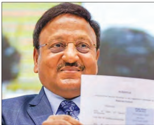
Chief Election Commissioner Rajiv Kumar speaks during a press conference for the announcement of schedule of Assembly elections in Himachal Pradesh, in New Delhi

Kumar said four metropolitan cities were among the 7-8 districts that had witnessed the least voting in the 2019 general elections. "We are focusing on urban apathy very, very seriously," the CEC said, adding that the chief electoral officers and district officers have been asked to focus on polling booths that have witnessed the lowest polling percentage in each constituency. Kumar said district electoral officers have been asked to personally visit such booths, find out reasons for lower turnout and address the difficulties faced by the people. He said the Commission has three broad objectives to hold free and fair, inclusive, accessible and inducement-free elections. The