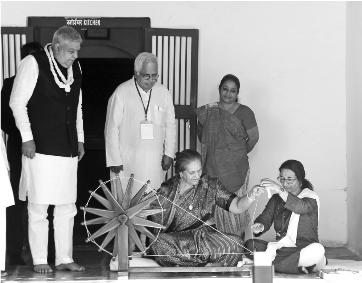
Vice President Jagdeep Dhankar with his wife at Sabarmati Gandhi Ashram on Friday

will also be held on December 8. The CEC also cited the weather in Himachal Pradesh as one of the reasons for the early announcement of elections in the hill state. Over 55 lakh voters are eligible to exercise their franchise for 68 assembly seats in Himachal Pradesh. There are 1.86 lakh first-time voters, 1.22 lakh aged 80-plus and 1,184 voters who are above 100 years of age. Himachal Pradesh has a 68-member assembly and the BJP had won a clear majority by winning 44 seats in the 2017 elections. The Congress managed to win 21 seats, Independents bagged two seats and the CPI(M) emerged victorious on one seat. In percentage terms, the BJP won 48.79 per cent of the total valid votes, followed by the Congress (41.68 per cent) and Independents (6.34 per cent). The BJP and Congress have given alternate governments in the hill state for over three decades. (PTI)