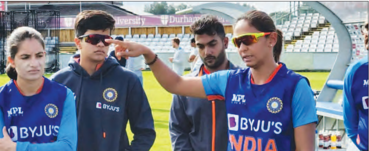
Harmanpreet Kaur and team will be eyeing their seventh Asia Cup title.

SYLHET, OCT 14 /--/ A ruthless Indian team would look to reassert its supremacy and aim to win an unprecedented seventh Asia Cup title when it clashes with Sri Lanka in the final here on Saturday. The tournament brought to fore India's depth as the younger crop of players has shouldered the burden of taking the team to the final without any tangible contribution from skipper Harmanpreet Kaur and her deputy Smriti Mandhana. Such has been the impact of the Indian team, that skipper Harmanpreet played only four games (81 runs) and in total faced a only 72 balls in those matches. Even Mandhana, who led in three games, skipped one game and didn't need to contribute much. The biggest takeaway from a tournament like this is that Indian team's junior members could react to pressure situations in a perfect manner when they were thrown at the deep end of the pool. The most heartening aspect was how three 'seasoned' youngsters -- 18-year-old Shafali Verma (161 runs and 3 wickets), 22-year-old Jemimah Rodrigues (215 runs) and 25-year-old Deepti Sharma (94 runs and 13 wickets) put their hands up and carried the team through to the