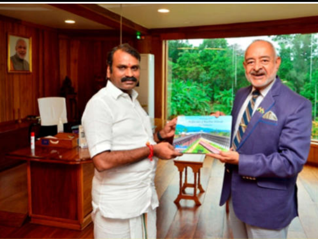
Dr. L. Murugan, Hon'ble Union Minister of State for Fisheries, Animal Husbandry, Dairying, Information & Broadcasting, Government of India on a two day visit to A&N Islands met Admiral D K Joshi, PVSM, AVSM, YSM, NM, VSM (Retd.), Hon'ble Lt. Governor, A&N Islands and Vice-Chairman, Islands Development Agency today at Raj Niwas. Discussed various infra/developmental projects and schemes being implemented by Andaman & Nicobar Administration under the aegis of Islands Development Agency.