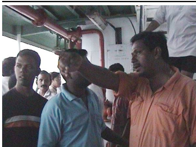
Crew of MV Sentinel negate the orders and decide to save

I still remember the Tri-Services along with the administration paying rich tributes to the jawans, their families and the natives on the first anniversary of Tsunami, who could not survive the Boxing Day. A