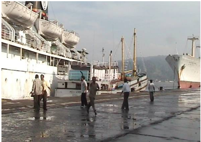
Merchant vessel at Haddo Wharf taking a 180° turn

“Tsunami se to bach gye par ab ye bhook aur pyaas pta nhi kitno ki jaan legi.” People cried.