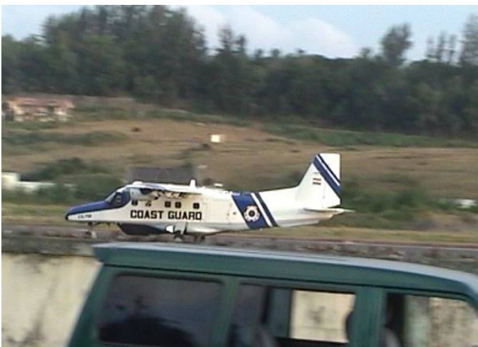
Defence aircrafts bringing in survivors from Nicobars

Continued from Page 4 reasons to the sea to be angry with us and once in a while nature understandably loses its cool. We sure have come a long way since the first Tsunami, we have all the sensors, ships, rules and a detailed mechanism to handle such a situation and everything, but still, ARE WE READY TO BEAR THE NEXT HIT? Have we prepared enough to take head on the sea as the opponent? NO! no matter how technologically advanced we get we will never be ready to take on nature. The only thing that we can do is be respectful towards it. Yes! Development has to go side