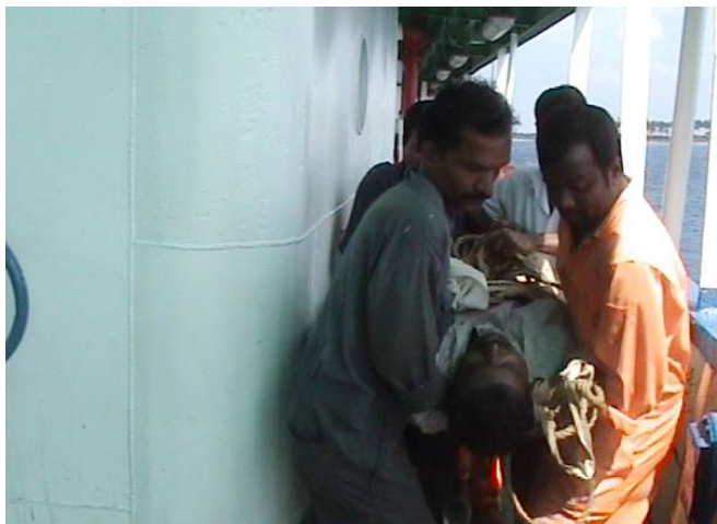
Crew of MV Sentinel working tirelessly to save precious lives

middle of the sea waiting for their turn. Real heroism was portrayed when the crew