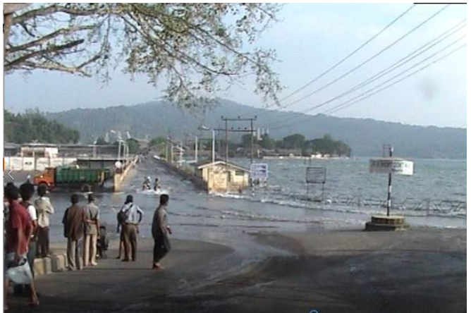
Chatham Bridge under sea water

already upside down and you could only make out the flat surface. One could see remorseful faces all around. They were not sad; they were a hell lot of scared. Some were curious about