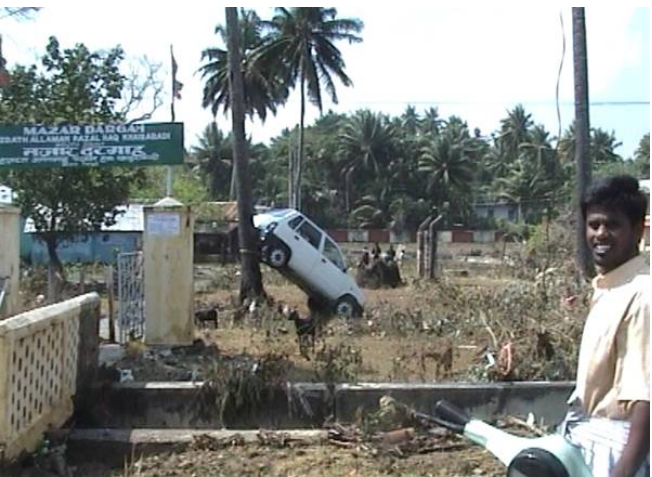
Maruti 800 moved upright on a tree trunk

what was happening, the Islands had never seen or felt such a thing ever. The Chatham bridge was underwater, the ships were floating to the level of a jetty, and the cars, autos, scooters everything one could see was floating. There was only chaos and chaos around.