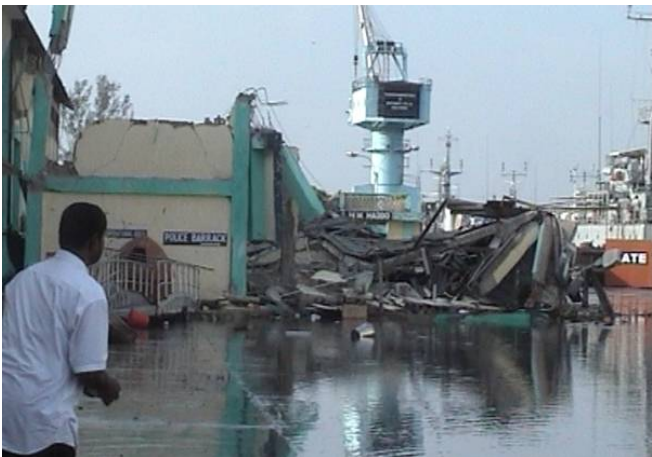
Building collapses at Haddo Wharf Following the Tremour

Revising what happened The first tremors were felt early morning, my whole family leapt out of the bed and went straight to the road and then the nearby playground. I could see dozens of people coming out of their houses, all with blank expressions about what was happening. Then after a few minutes of heart-tightening tremors, they stopped and we all gave a smile of relief to one another. Then the news started pouring in. How a newly constructed house on a pillar gave up and crumbled like a house of cards. Another one said how the old building in Haddo wharf collapsed to the ground and one can hear the wails of people stuck inside it, luckily it was of people on the out and there was no one in. The ships were being sent to the sea to avoid damage. The ropes from the bollards were being ferociously untied. One merchant vessel, in all the clamour and chaos, cast off with one of its ropes still tied to the Bollard. This Bollard via the rope pulled it back and under the fast swell of the sea it rotated 180 degrees to one side,