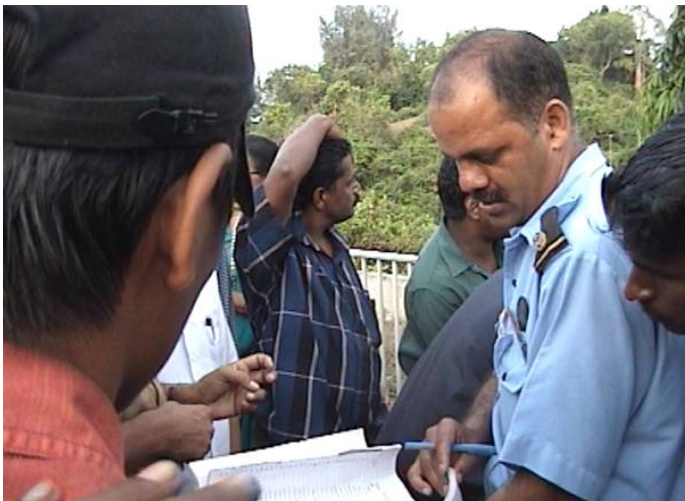
The Tri-Command officials with lists of rescued survivors

by side and change is the only constant law of nature but we should not let our greed dig our own grave. Let the development be sustainable in its true measure not just on paper. This earth is not ours, we are mere tenants. Let us mend our ways before the owner loses his cool again.