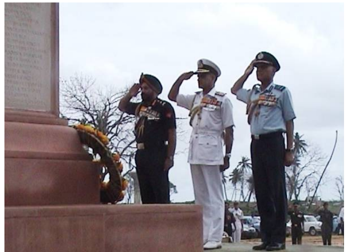
A year after Tsunami at the memorial constructed at the Air Force Base in Car Nicobar

Many accusations were made on the duties of many in the position of power at that time without understanding the due pressure under which each and every one was. This makes it much more pertinent to remember those days so that due precautions and arrangements could be made to revert future tragedies as well as be self-equipped to face them be it a local man, administration or the armed forces.