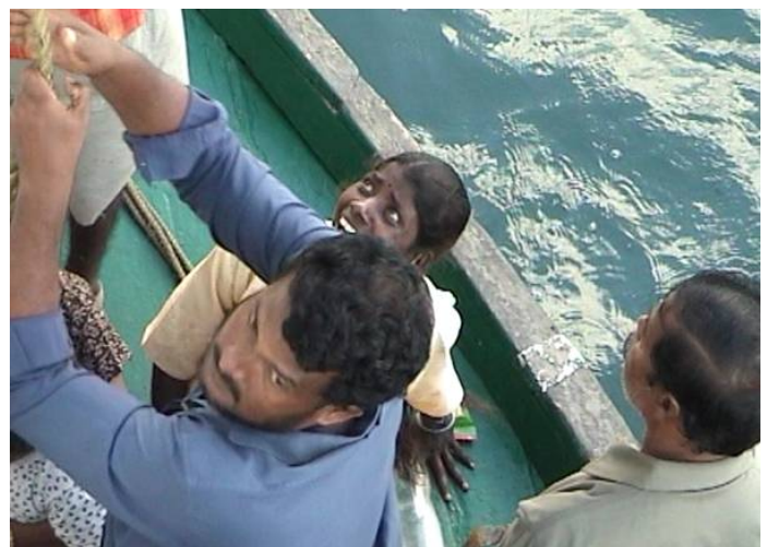
A women in a dinghy at Nancowry crying for her child