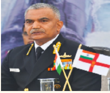
Admiral R. Hari Kumar

Speaking ahead of the Navy Day (December 4) on Saturday, the Navy chief said details of the proposed maritime command are being worked out, and indicated that its basic structure may come up in the first quarter of 2022. While acknowledging the significance of integration of armed forces, he said the appointment of Chief of Defence Staff (CDS)