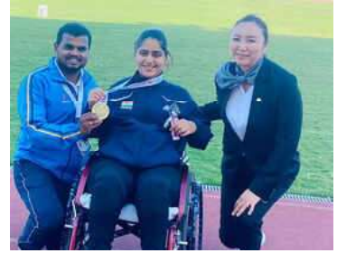
Indian Paralympians and officials

Around 750 Para athletes under 23 years of age from 30 countries are competing across nine sports - Para athletics, Para badminton, boccia, goalball, Para powerlifting, Para swimming, Para table tennis, Para taekwondo, and wheelchair basketball.