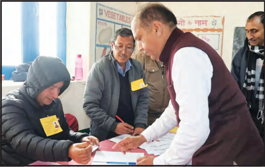
Himachal Pradesh Chief Minister Jai Ram Thakur gets his finger marked with indelible ink after casting his vote for Assembly elections, at a polling station in Mandi district

state will vote for the return of the old pension scheme and employment. "Himachal will vote for OPS, Himachal will vote for employment and Himachal will vote for 'Har Ghar Lakshmi'," Rahul said in a tweet in Hindi. "Come, vote in large numbers, and make your valuable contribution to the progress and prosperous future of Himachal," the former Congress chief said, appealing to the voters of the hill state. Rahul is in Maharashtra undertaking the party's 'Bharat Jodo Yatra'. Restoration of the old pension scheme, 300 units of free power, a Rs 680-crore StartUp fund, one lakh jobs and Rs 1,500 per month for women between 18 to 60 years are among the promises the Congress made in its manifesto for the Himachal Pradesh polls. (PTI)