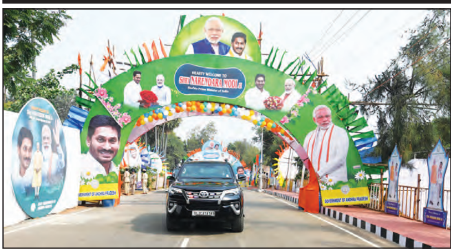
Prime Minister Narendra Modi being welcomed by people, in Visakhapatnam on Saturday

Modi spoke about the government's welfare schemes, including free ration and free vaccination drive. He said the Telangana government talked about building double-bedroom houses for poor but it did not let houses to be constructed under the PM Awas Yojana. "Today, Telangana wants positivity, progress that only BJP can give," he said. Chandrasekhar Rao did not receive the Prime Minister at the Begumpet airport. Ruling TRS MLC K Kavitha alleged that the Prime Minister came empty-handed without announcing anything concrete for Telangana. "Today Prime Minister Modi came to our State. He came empty-handed... Other than delivering empty words, he doesn't do anything good for us," said Kavitha, daughter of Chandrasekhar Rao. (PTI)