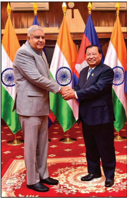
Vice President Jagdeep Dhankhar and Cambodian Senate President Samdech Vibol Sena Pheakdey Say Chhum, exchange greetings during a meeting, in Phnom Penh on Saturday

PHNOM PENH, NOV 12 /--/ Vice President Jagdeep Dhankhar and Cambodia Prime Minister Hun Sen on Saturday held discussions on ways to further enhance bilateral ties, including in areas like human resource, de-mining and development projects.