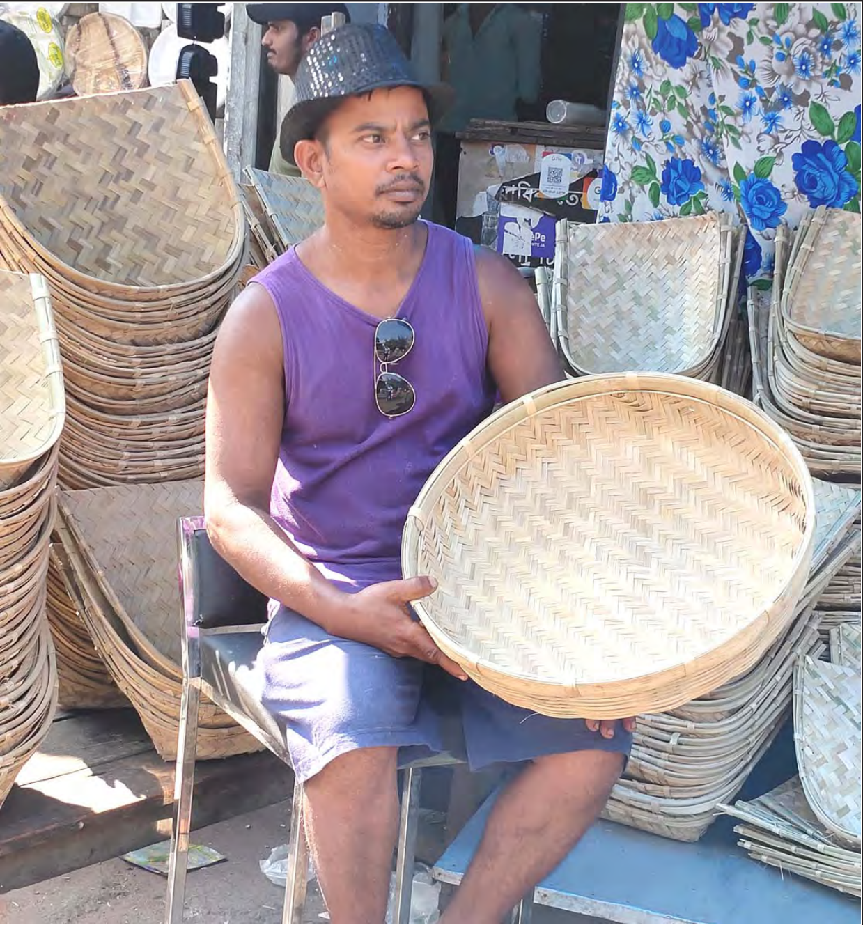
A roadside vendor displays split bamboo products for sale in Kolkata on Saturday

But it should also spark some soul-searching from the Democrats, who are already treating a projected loss of the House as a victory. If the party was able to capitalize on GOP extremism to this extent under these conditions, one can only imagine how they might have done with an actual economic message and accomplishments to back it up. (IPA)