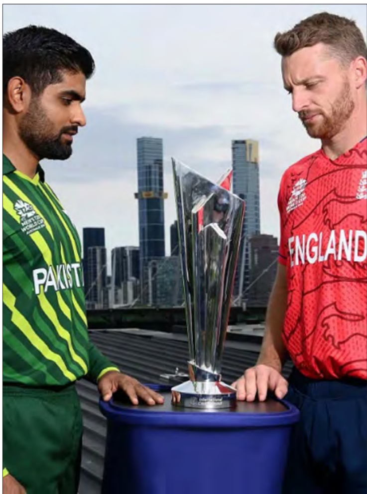
ALL EYES ON THE PRIZE: Who of Jos Buttler or Babar Azam will take the trophy home?.

The Shaheen Shah Afridis, Mohammed Wasim Jr. and the Harris Raufs will need way more than just inspiration to get past the likes of Jos Buttler, Alex Hales, Ben Stokes and Moeen Ali. These are all sought after practitioners of T20 cricket and all of them have abilities to silence the 80,000 odd Pakistan fans, just like they did with the bulk of the 42,000 Indian fans in Adelaide. Can Afridi do a Wasim Akram when Buttler is batting or Babar and Rizwan take the game deep in their own style like Imran Khan and Javed Miandad did in that 1992 final. Big matches always brings big performer to the centre stage and Stokes for one wouldn't mind a repeat of his 2019 Lord's performance to win the silverware. The weather forecast predicts that the final could be marred by rain on both Sunday and the reserve day, which is Monday. Unlike a normal T20 game which could be a minimum five-over contest, the event technical committee has kept provisions for minimum 10-overs a side contest with an early (3 pm Melbourne time) start on reserve