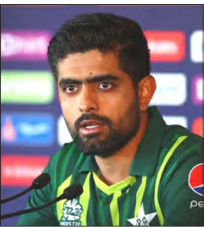
Babar Azam at a press conference on the eve of the final

"We will try to maintain and continuously build our momentum hence ensuring