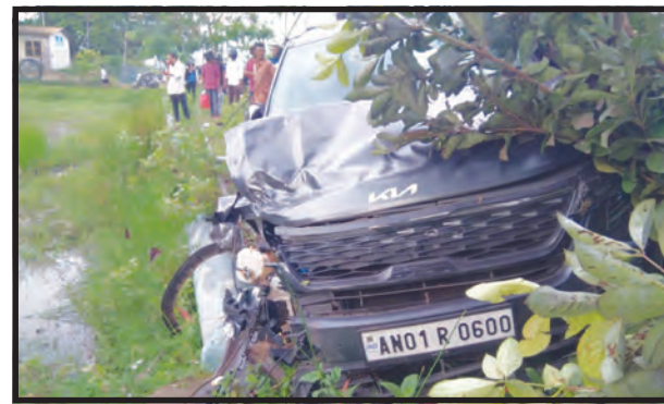
A speeding car hit a motorcycle at Sippighat on Saturday afternoon leaving serious injuries to the bike rider.

"Soaring airfares has made life miserable for the common man here. It cost about Rs 4000 to 5000/- to travel to Dubai or Malaysia. But for Port Blair, the fares have touched almost Rs 10,000/- for a one-way ticket. Promises made by the administration and elected political leaders have fallen flat on all counts. Our children studying in mainland eagerly awaiting for the festive season to come back to Port Blair for vacations have been left dejected. So steep are the airfares that they are unable to avail the flight service this year. We're terribly disappointed as we won't be able to celebrate the festival with our children this year. The UT administration should take decisive steps and take up the issue with the Central Government to provide respite for the islanders from surging airfares as also ensure resumption of the chartered flight services," said some others. (File Photo)