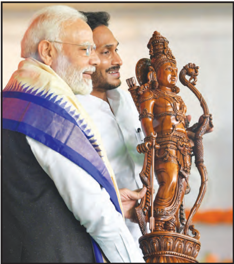
Prime Minister Narendra Modi at the launch of multiple development projects, in Visakhapatnam, on Saturday. Andhra Pradesh CM Nara Chandrababu Naidu is also seen

HYDERABAD, NOV 12 /--/ Prime Minister Narendra Modi on Saturday made the "family politics" jibe at the ruling TRS in Telangana and said the state needs a government that works for all families and not just one.