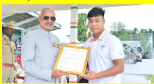
Hon'ble Lt Governor presenting LG's Commendation Certificate to Shri David Bekham, Sportsperson (Cyclist).