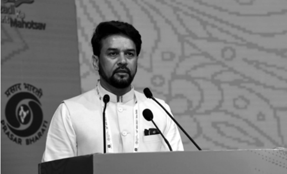
Union Minister for Information & Broadcasting, Anurag Singh Thakur addressing at the 59th Asia-Pacific Broadcasting Union (ABU) General Assembly & Associated Meetings 2022, in New Delhi

organisations. Thakur also credited the media for coming to the aid of those stuck at home during the Covid-19