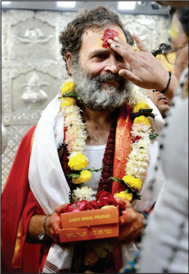
Priest applying tilak on forehead of Congress leader Rahul Gandhi at Mahakaleshwar temple in Ujjain

(The author, a military veteran, is a former Lt Governor of Andaman & Nicobar Islands and Puducherry. The views expressed are his personal)