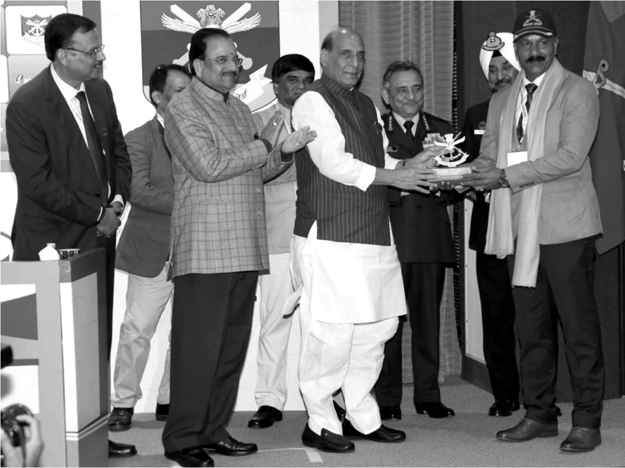
Defence Minister Rajnath Singh felicitating prominent CSR contributors to the Armed Forces Flag Day Fund during CSR Conclave, organised by Department of Ex-Servicemen Welfare in New Delhi