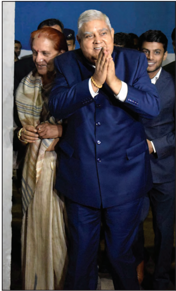
Vice president Jagdeep Dhankhar visit at Kalighat Temple in Kolkata on Tuesday