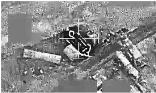
17 dead and knocked out of the struggling country's internet.

Yemen rebels fired missiles at the United Arab Emirates and Saudi Arabia, with coalition forces hitting back by blowing up the insurgents' launchpad as a sharp escalation of hostilities entered a second week on Monday. Witnesses saw bright flashes arcing over the Emirati capital Abu Dhabi in the early hours of Monday morning as two ballistic missiles were intercepted, scattering debris. Nobody was hurt in the attack, which came a week after the Iran-backed Huthi rebels killed three people in a drone and missile assault on Hecy, triggering a volley of deadly air strikes on Yemen. Separately, missiles were fired on Saudi Arabia in southern regions bordering Yemen, with two people wounded in Jazan, and another missile intercepted over Dhahran Al-Janub. The UAE said an F16 fighter jet destroyed a Huthi missile launcher in Al-Jawf in northern Yemen at 4:10 am (0110 GMT), "immediately after it launched two ballistic missiles at Abu Dhabi". It released a black-and-white video of the attack, showing an explosion followed by a large fire that sent up plumes of thick smoke.