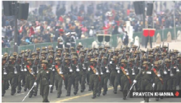
Six Army contingents marching in the Republic Day parade this year will showcase the different uniforms worn and weapons carried by soldiers through