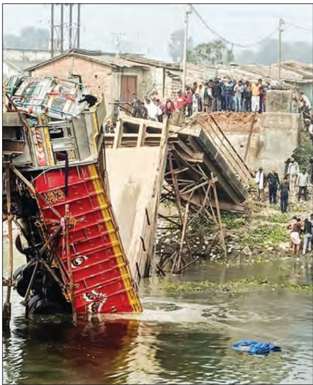
Rescue operation underway after a truck fell into the Kamla river due to collapse of a portion of a bridge over it in Darbhanga district, Bihar