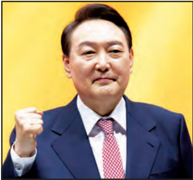
Yoon Suk Yeol

ABU DHABI, JAN 16 /--/ South Korean President Yoon Suk Yeol said on Monday that his nation's efforts to be carbon neutral by 2050 would rely in part on returning to nuclear power, even though his predecessor had tried to move away from atomic power. Yoon's comments at a summit in the United Arab Emirates, made in front of the country's leader, Sheikh Mohammed bin Zayed Al Nahyan, served to underline Seoul's commitment to nuclear power as it works to finish the Arabian Peninsula's first atomic power plant. That could see South Korea in line for lucrative maintenance contracts and future projects in the UAE, which Seoul has grown closer to over recent years. "If our two countries join efforts in clean energy development it will not only enhance our two countries energy security but also will contribute to global energy market stability," Yoon said in an address at Abu Dhabi Sustainability Week. The UAE also promises to be carbon neutral by 2050 a target that remains difficult to assess and one that the Emirates still has not fully explained how it will reach. The USD 20 billion Barakah nuclear power plant, Seoul's first attempt to build atomic reactors abroad, will one