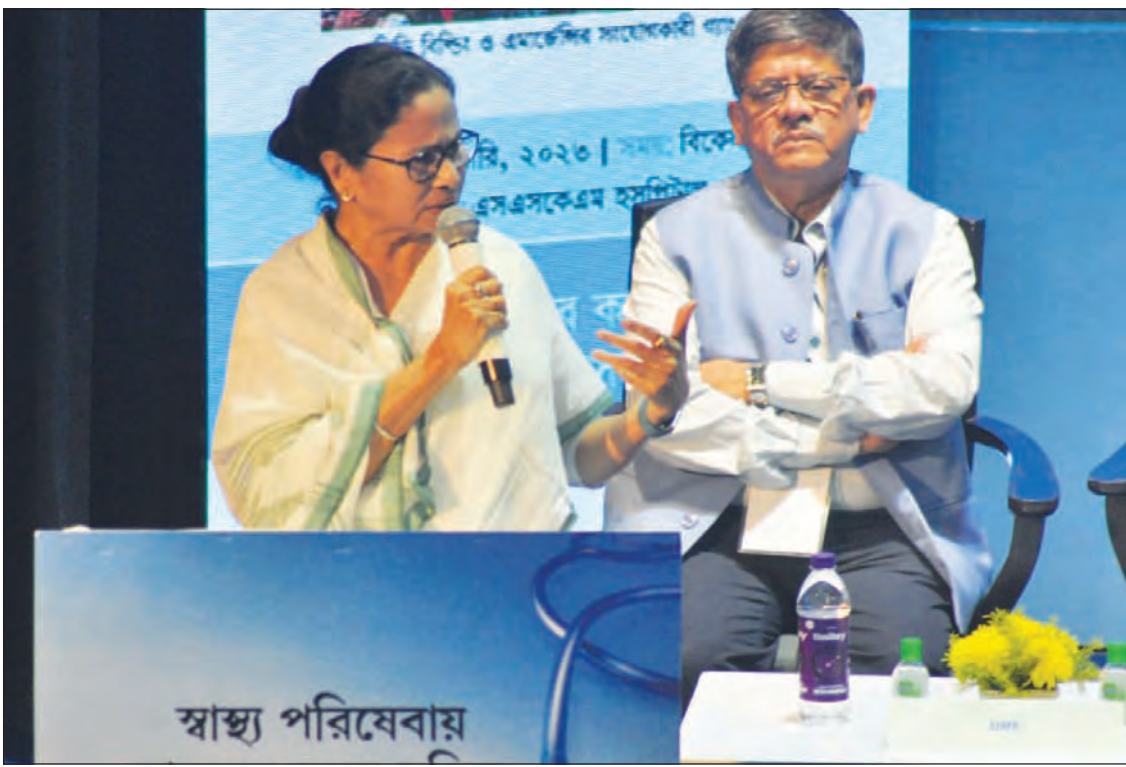
Chief Minister Mamata Banerjee at an event at SSKM Hospital, on the occassion of the IPGME&R-SSKM's foundation day on Monday

would not impose any tax on the pilgrims. "Whatever we could, we did for the Gangasagar Mela. There's nothing to be worried about; we will generate funds as per our capability... I will not impose tax on pilgrims, but I will definitely try to get funds for the mela. "You (Centre) cannot just decide on not giving funds and then stop us, too, from sourcing it from elsewhere," she said. Earlier this month, the chief minister had alleged that the Union government, despite requests, did not take any measure to help the state build a bridge over the Muri Ganga river for pilgrims to reach the island without hassle. "The Central government provides huge funds for the Kumbh Mela. They bear the entire expenses, but Bengal gets nothing for the Gangasagar Mela. I will request the Centre again to declare the event a 'national fair'," she had said during her visit to the island. (PTI)