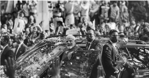
Prime Minister Narendra Modi waving at people who lined the roads to catch a glimpse of him, during the roadshow, in New Delhi

manufacturer of mobile phones, third-largest manufacturer in the auto sector while the highway being built every day has risen to 37 km from 12 km earlier, the party president said. The country has also worked to empower the poor with a number of welfare schemes, including that of free grains, he added. Nadda praised the party's win in the recent Gujarat assembly polls as "extraordinary and historic", saying winning more than 150 seats in the 182-member assembly is a great achievement. While the party lost in Himachal Pradesh to the Congress, the vote gap between the two parties was less than one per cent, he said. (PTI)