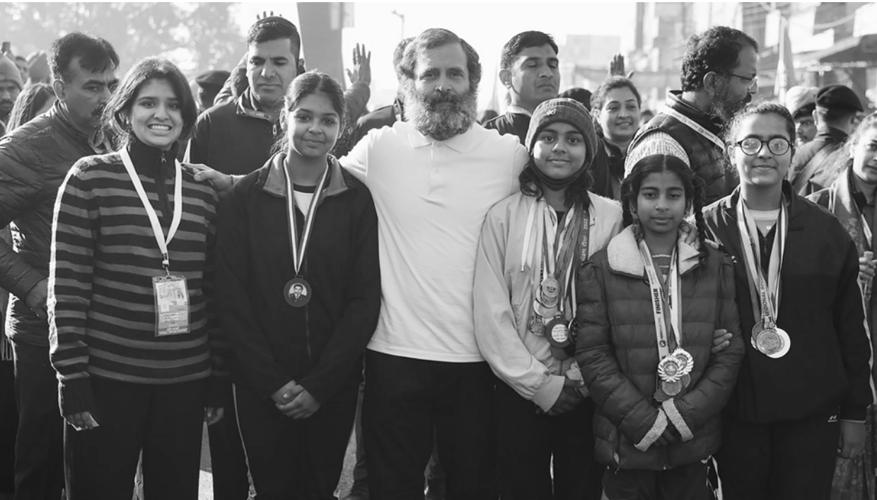
Congress leader Rahul Gandhi with young supporters during the party's Bharat Jodo Yatra, in Jalandhar, on Monday

over," Kejriwal said. Notably, the State Council of Educational Research and Training (SCERT) had planned to send two groups of 30 primary in-charges to Finland in December 2022 and March 2023. The Council has also made a budget provision in its annual plan and was given a grant-in-aid by the Delhi government for conducting such training programmes. "It is reiterated that the Lieutenant Governor has not rejected the proposal of training programme for primary-in-charges in Finland. Any statement on the contrary is deliberately misleading and mischievously motivated," an official from Raj Niwas said. According to the official, the AAP-led government has been advised to evaluate the proposal in totality and "record the cost benefit analysis in terms of impact on quality of education being provided to students so as to assess the effectiveness of various foreign training programmes for teachers undertaken in the past". "The LG has also advised for examining and identifying similar training programmes in the Institutions of Excellence, within the country, so as to ensure optimal utilisation of resources, fiscal prudence and administrative effectiveness," the official said. The city government has so far sent 1,079 teachers to different countries for training. Of these, 59 have gone to Finland, 420 to Cambridge and 600 to Singapore. Besides, 860 school principals have been imparted training in prestigious institutes like IIM Ahmedabad and IIM Lucknow. (PTI)