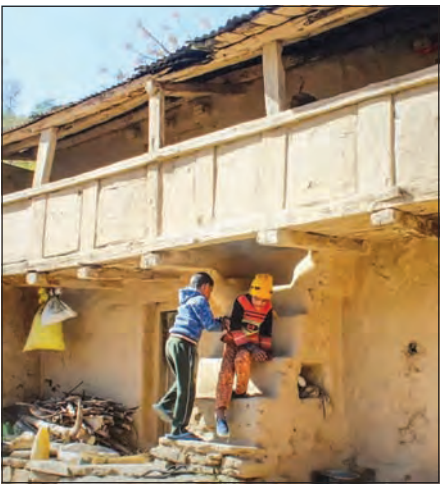
Children at a residential area affected by land subsidence, in Joshimath