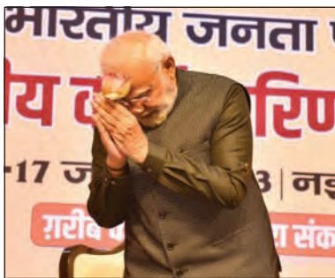
Prime Minister Narendra Modi attends the BJP National Executive meeting, at NDMC Convention Centre in New Delhi on Monday

has this potential and Agniveers will play a leading role in the forces in the times to come. The Prime Minister said new India is filled with renewed vigour and efforts are underway to modernise the armed forces as well as make them 'aatmanirbhar' (self-reliant). In the 21st century, the way wars are fought is changing, he said, speaking about the new fronts of contactless warfare and challenges of cyber warfare. Lauding their potential, Modi said their spirit is reflective of the bravery of the armed forces which has always kept the flag of the nation flying high. The experience they will acquire through this opportunity will be a source of pride for life, the Prime Minister added. "Hailing the potential of youth and Agniveers, Prime Minister concluded by saying that they are