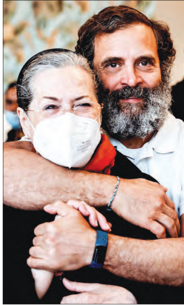
MOTHER WITH SON: Congress leader Rahul Gandhi with his mother and former Congress President Sonia Gandhi, who joined the Bharat Jodo Yatra today, near Red Fort on Saturday