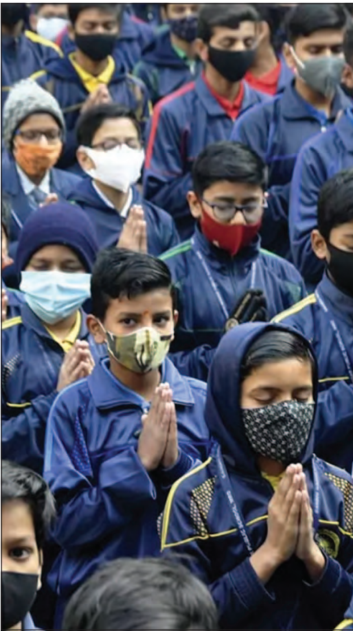
COVID CAUTION: Children wearing face mask attend morning assembly at their school in Moradabad, amid surge in Covid cases in several countries