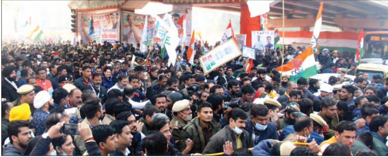
Congress workers and supporters in large number join the Bharat Jodo Yatra to walk alongwith Rahul Gandhi and other members of the Gandhi family, in New Delhi on Saturday

Rahul accuses BJP of using communal hatred as weapon to divert people's attention