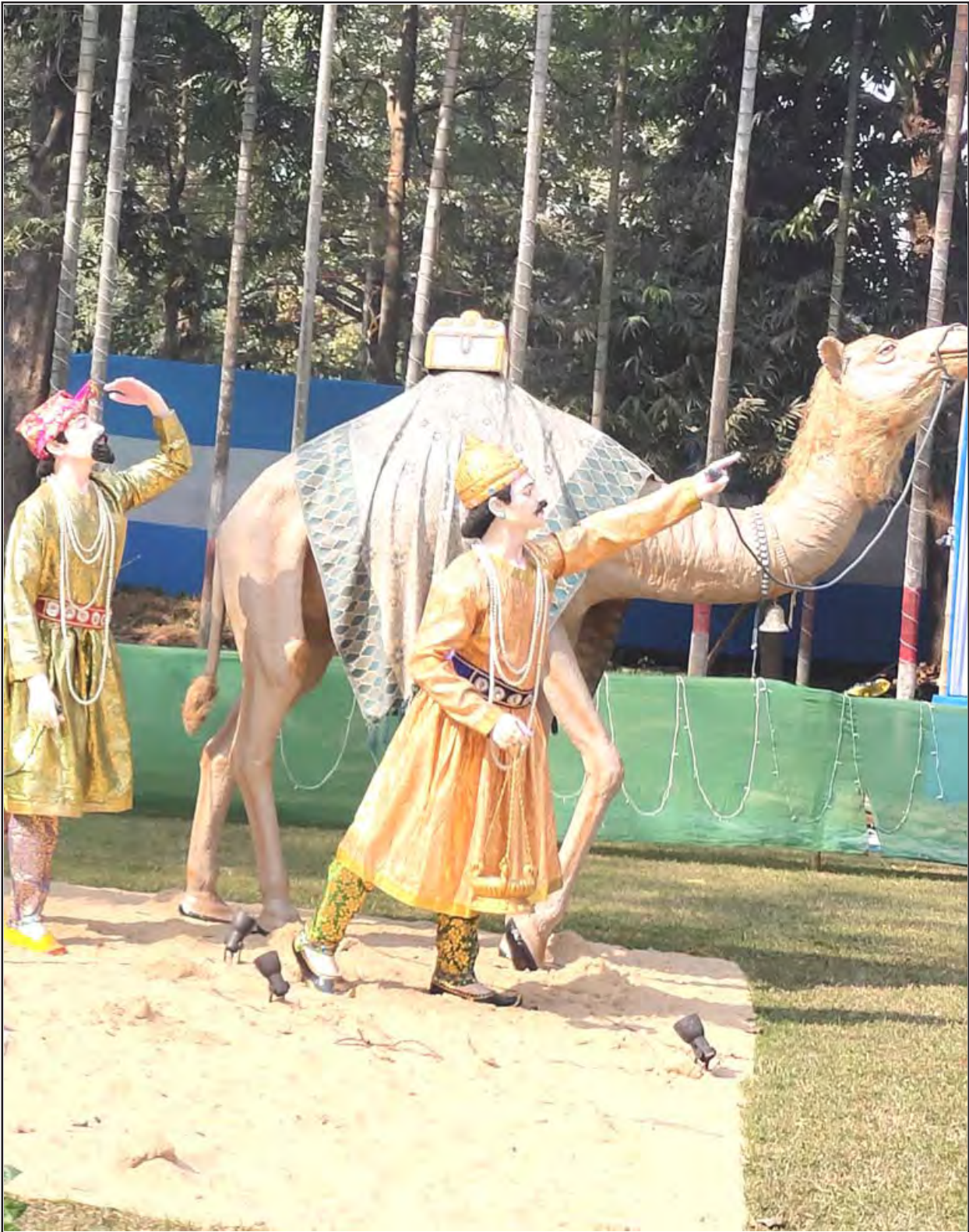
A tableau at St Paul’s Cathedral--Arijit Ganguly