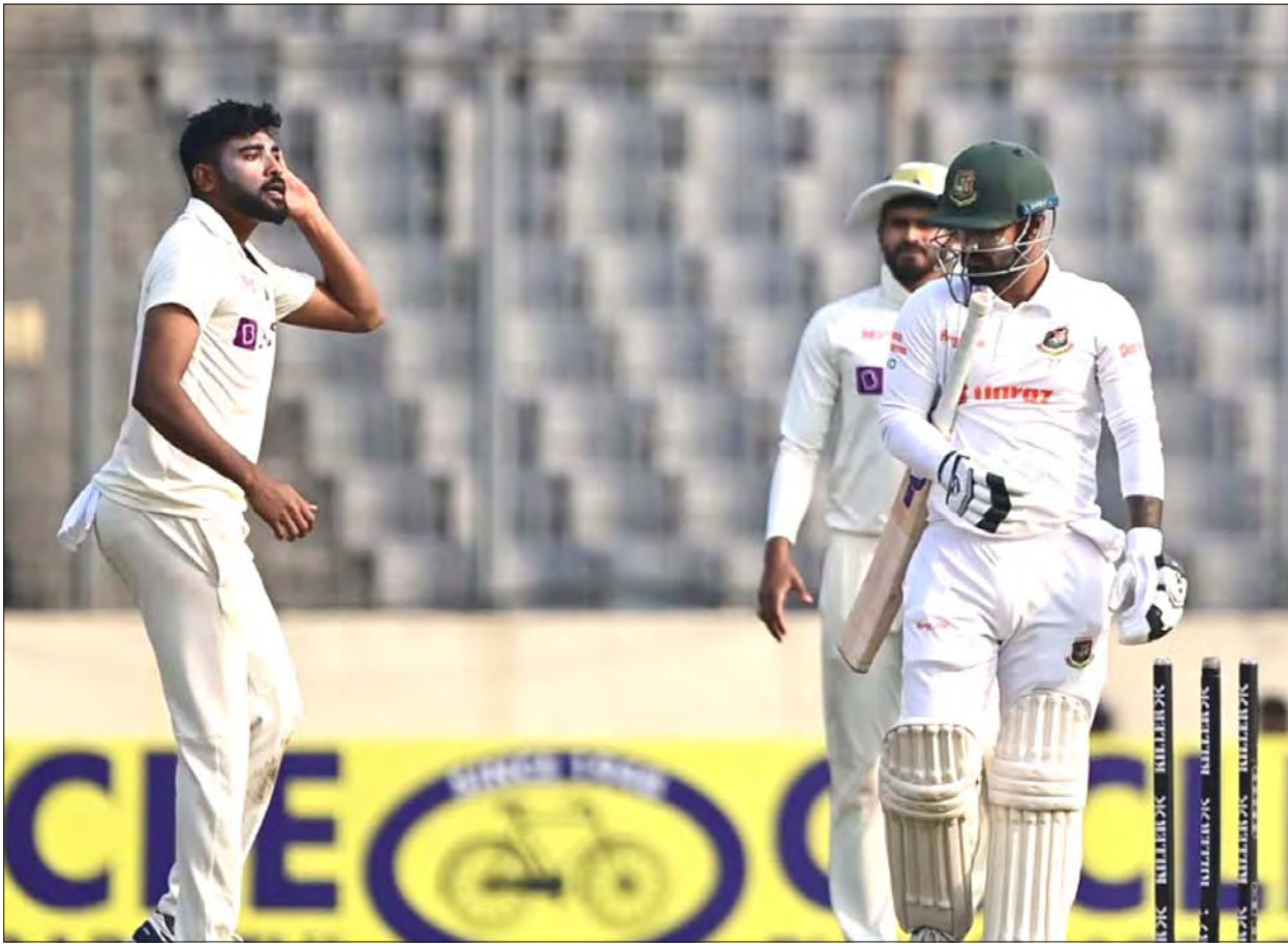
Mohammed Siraj reacts after dismissing Litton Das

While Gill was stumped off a doosra, becoming Miraz's second victim, Kohli had no choice but to come out late in the evening as the pitch, at times, was