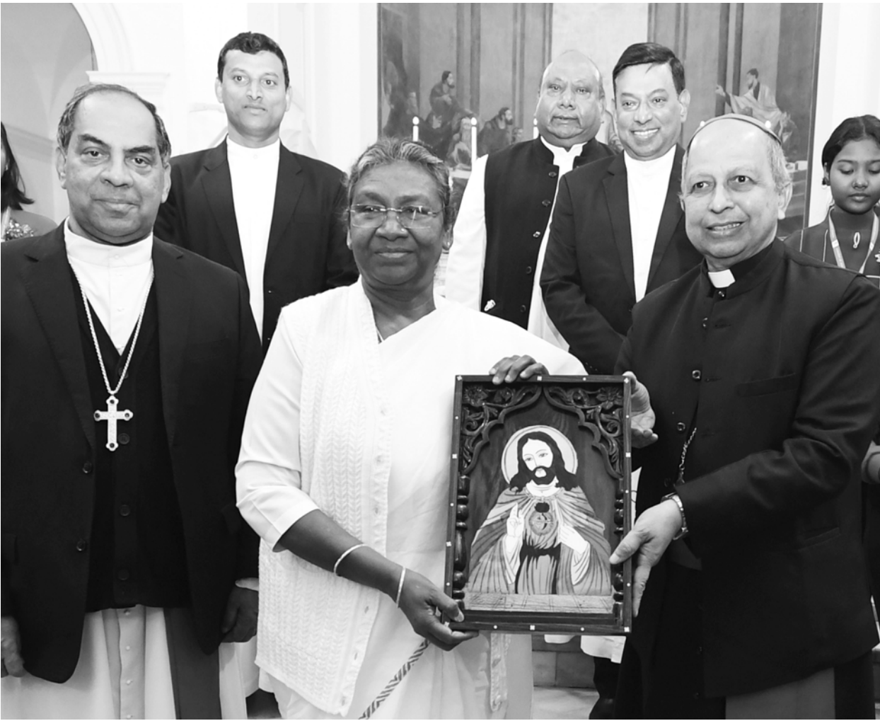
President Droupadi Murmu visited the Sacred Heart Cathedral church, in New Delhi on Saturday

"Sample testing of international passengers, including those from China, Hong Kong, Bangkok, Japan, South Korea, has been initiated at the Delhi International Airport. All necessary steps are being taken in view of the evolving coronavirus situation." With China and other countries witnessing a surge in Covid-19 cases, Prime Minister Narendra Modi on Thursday cautioned against complacency, called for a strict vigil and directed that the ongoing surveillance measures, especially at the international airports, be strengthened.