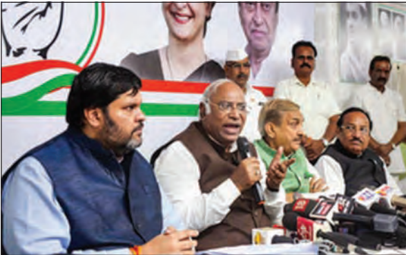
Congress presidential poll candidate Mallikarjun Kharge interacting with media, in Bhopal

contacted us over the issue," Mistry said. On individuals canvassing for one candidate or the other, the poll authority cannot stop any individual from campaigning, he said. "But as far as the level playing field is concerned, we have tried our level best to see to it that it gets implemented," he said in response to a question on Tharoor's reported comments that some aspects of the poll suggest an uneven playing field. Mistry demonstrated to reporters the ballot boxes, ballot paper and how the votes would be cast. He said the sealed boxes would be transported to Delhi, kept in a strong room at AICC headquarters and opened in Delhi. The ballot papers would be mixed before counting starts. (PTI)