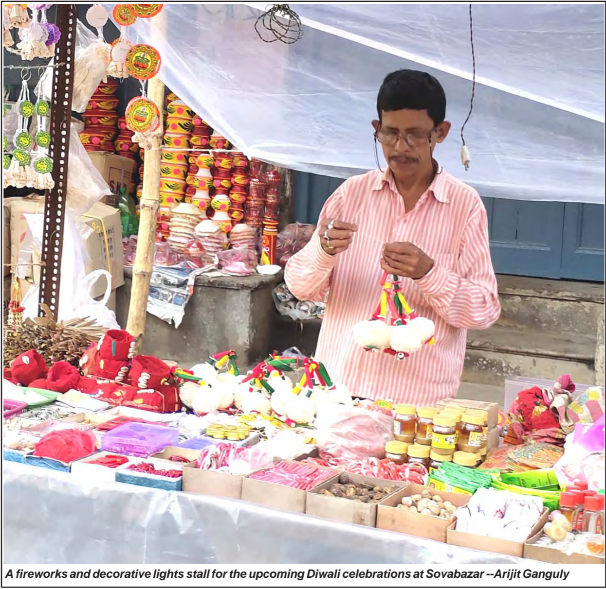
A fireworks and decorative lights stall for the upcoming Diwali celebrations at Sovabazar --Arijit Ganguly