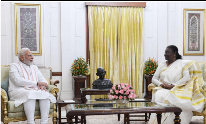
The Prime Minister Shri Narendra Modi calls on President of India, Smt. Droupadi Murmu, in New Delhi on July 26, 2022.