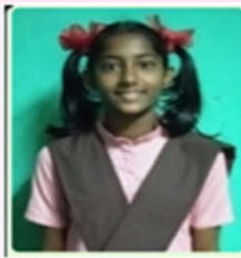
R Kashthuri Bhai GDMS Sr. Sec School