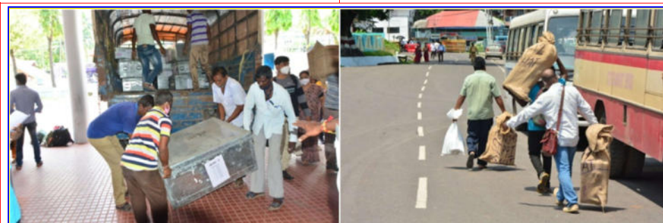
Pics show polling materials being distributed to Poll Officials of respective Polling Stations for conduct of Panchayat and Municipal Elections-2022

Similarly, for smooth counting of votes all vehicular traffic shall be closed on March 6 from 5 PM to till the completion of counting the votes from Girls School Junction (Marina Park area) to Govt Press via R.K Mission, a press release from DM (SA) said.