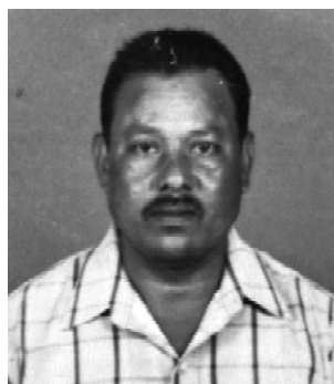
LATE T. VALLABHA RAO