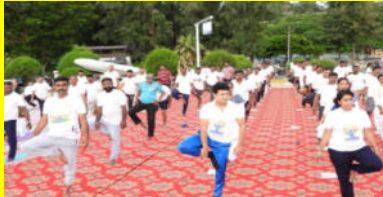
Yoga demonstration by PBMC