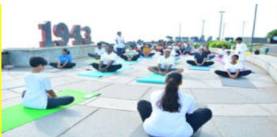
Yoga demonstration at Flag Point