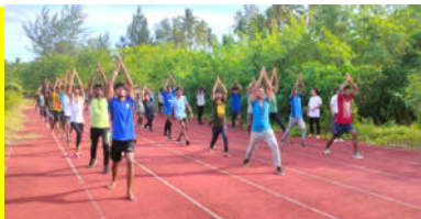
Yoga demo held at Arong, Car Nicobar