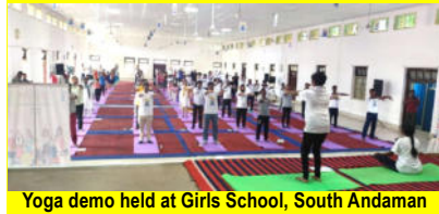
Yoga demo held at Girls School, South Andaman