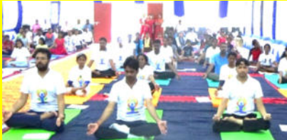
Yoga demonstration held at N&M Andaman