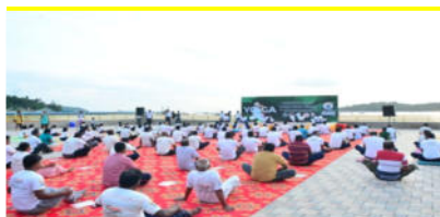
Yoga demonstration at Marina Park