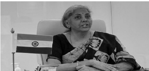
Finance Minister Nirmala Sitharaman today said the Supreme Court's order on the 2005 Antrix-Devas deal was "proof of the Congress's misuse of power". The case involves

The case involves a satellite deal in 2005 between the Indian Space Research Organisation's commercial arm Antrix and Bengaluru-based startup Devas Multimedia.