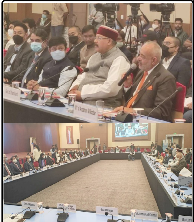
Admiral D K Joshi, PVSM, AVSM, YSM, NM, VSM (Retd.), Hon'ble Lt Governor, A&N Islands and Vice-Chairman, Islands Development Agency participated in the conference of the Ministers of Civil Aviation from States and UTs chaired by Shri Jyotiraditya M Scindia, Hon'ble Union Minister of Civil Aviation, Government of India at New Delhi. Calibrated opening of aviation sector and creating congenial ecosystem for its growth/strengthening, with an effective road map were discussed. Impressed upon the need for expedition of new Greenfield Airport at Port Blair and commencement of Sea Plane Operations.

The Director, ANIIMS, Dr. AK Mandal informed that currently 4 COVID patients are undergoing treatment at G B Pant Hospital and no patient is on oxygen / ventilator.