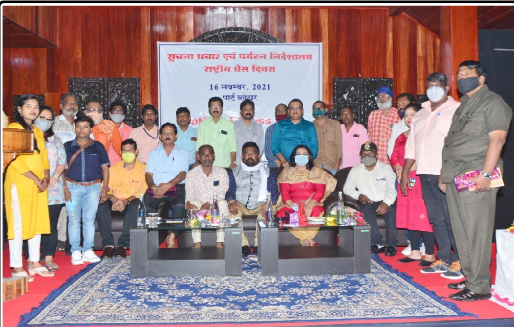
National Press Day was celebrated in a befitting manner at Andaman Club on 16/11/2021. Member of A & N Media Federation and other local Media persons participated. The programme was a grand success.