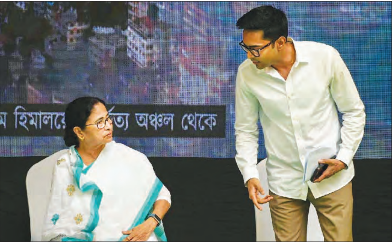
Chief Minister and TMC supremo Mamata Banerjee and party's national general secretary Abhishek Banerjee at the convention of party workers and leaders at Nazrul Mancha, on Monday