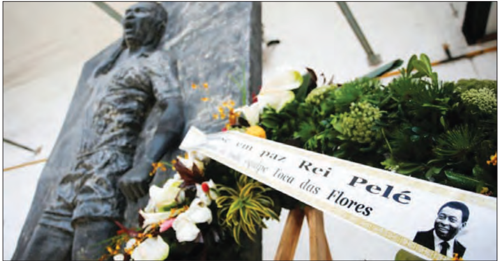
Flowers are seen in front of a statue of Brazilian soccer legend Pele at the Vila Belmiro Stadium on the eve of Pele's funeral in Santos