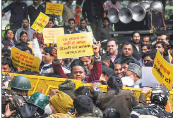
Locals protesting the death of the 20-year-old woman in Sultanpuri

thoroughly looked into," The LG tweeted Sunday night. The LG office sources said Saxena is keeping a tab on the situation on a "real-time basis" and has asked the authorities to keep him abreast of the autopsy report of the victim and its corroboration with the findings of the police investigation. The LG has also cautioned against opportunistic scavenging and urged people to work towards a more sensitive society. "Even as every possible support/help and beyond to the family of the victim will be ensured, I appeal to all to not resort to opportunistic scavenging. Let's together work towards a more responsible and sensitive society," he said in a tweet. In his meeting with the Police Commissioner, the LG reiterated his direction that every angle and aspect of the case be looked into and the strictest possible sections of IPC be invoked against the accused, the sources said. (PTI)