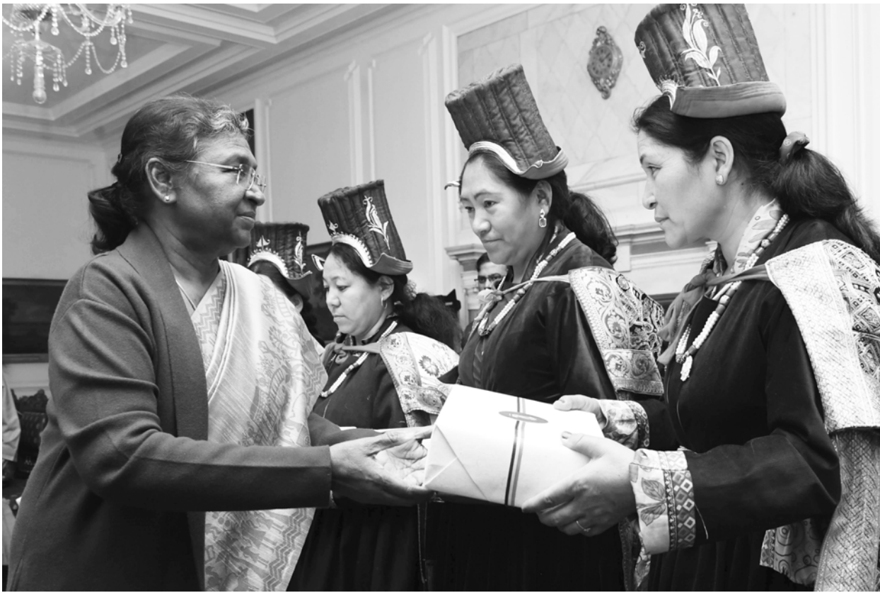
President Droupadi Murmu with Veer Naaris from Leh who participated in Capacity Building Tour organised by the Army, at Rashtrapati Bhavan on Monday