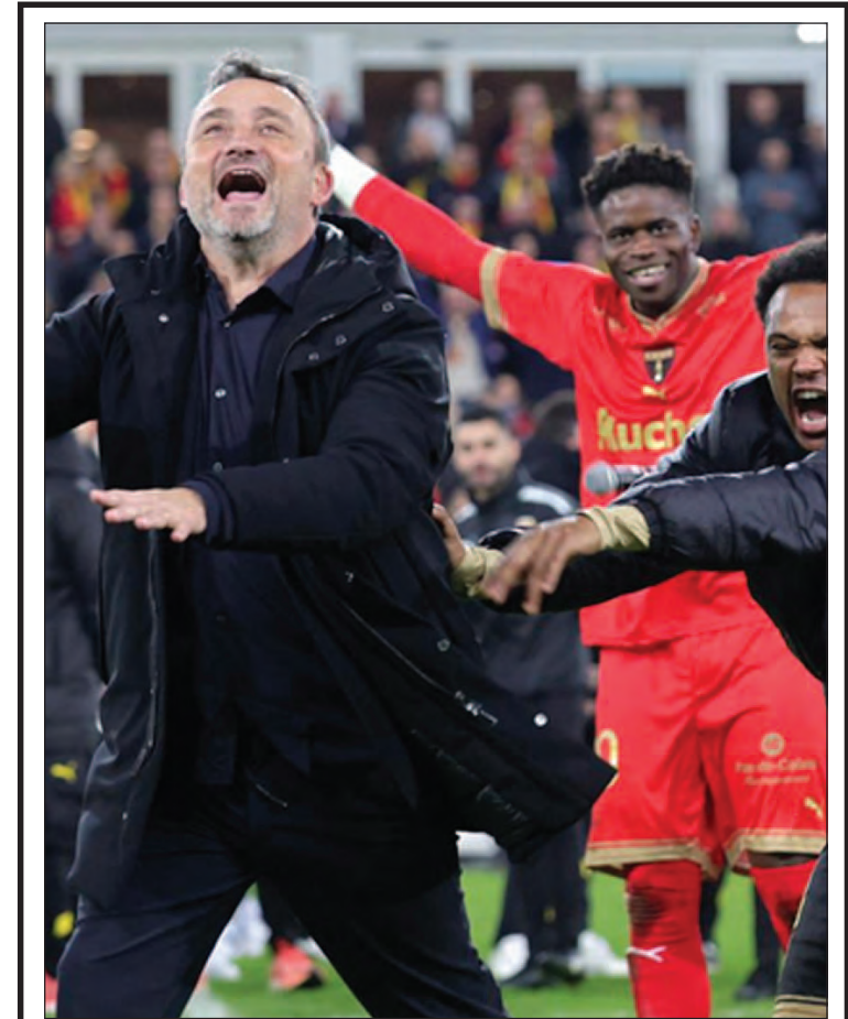
Lens coach Franck Haise celebrates after the match against PSG

LENS, JAN 2 /--/ Paris Saint-Germain, without World Cup winner Lionel Messi and Neymar, lost for the first time in any competition since March 20 last year when they were defeated 3-1 at Lens on Sunday. "Lens deserved their win," said PSG coach Christophe Galtier. Lois Openda scored one and set up another as Lens, who have only lost once in Ligue 1 this season, closed the gap on PSG at the top to four points after 17 rounds. "We are happy to be four points behind," said Lens coach Franck Haise. "This victory proves that we can beat anyone in this championship." PSG's last loss was more than nine months ago when they fell 3-0 at Monaco in Ligue 1, although that still left them 12 points clear at the top of the table. On Sunday at Lens, PSG were without Messi and suspended Brazilian Neymar, but Kylian Mbappe, the Golden Boot winner in Qatar, received a rousing welcome from the Lens fans as he warmed up. Galtier said he hoped French fans would give Messi a similar reception. "He's going to join us on January 3, in 48 hours," said Galtier. "I hope Leo will be well received. He won the most beautiful trophy by being very good. We know he's a great and decisive player so we hope he'll be well received obviously." "Kylian worked hard," said Galtier. "He showed a very good attitude." "Leo and 'Ney' were not there but that is no excuse." (AFP)