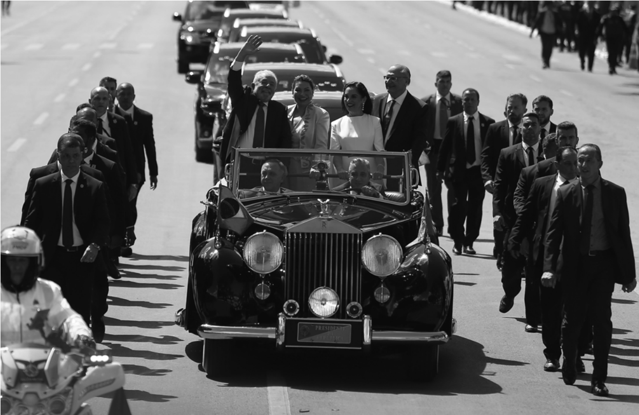
Luiz Inacio Lula da Silva and Vice President-elect Geraldo Alckmin, as well as their wives, take a convertible in Brasilia