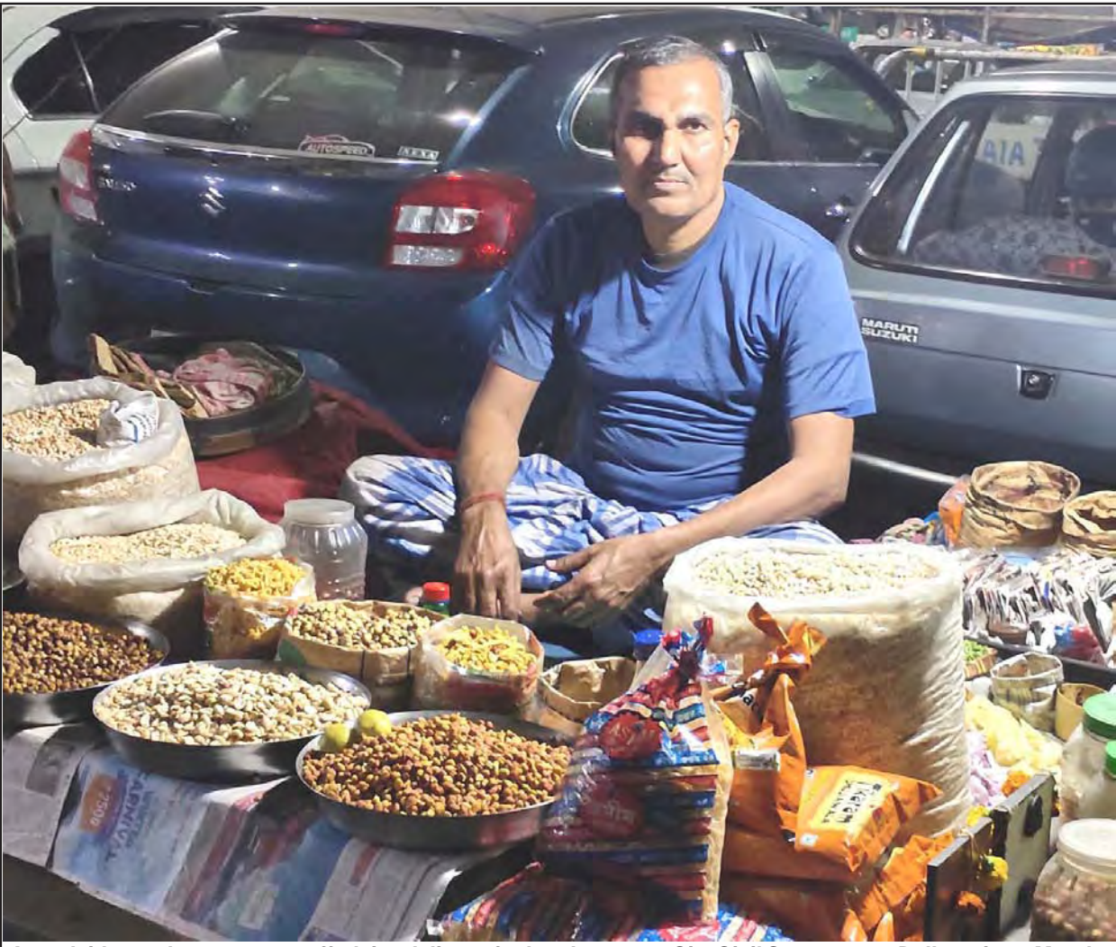
A roadside vendor prepares puffed rice delicacy for lunch goers at City Civil Court area at Dalhousie on Monday afternoon

Rains have also broken records. The Indian Monsoon onset was earlier and withdrawal later than normal this year. The majority of Indian subcontinent received high rainfall which flooded several parts of the region. There was significant flooding in India at various stages during the monsoon, particularly in the north-east in June, with over 700 deaths reported from flooding and landslides, and a further 900 from lightning. Floods also triggered 663000 displacements in the Indian state of Assam. Record breaking rain in July and August led to extensive flooding in Pakistan,