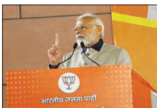
Prime Minister Narendra Modi addressing BJP workers after party's victory in the Gujarat Assembly elections, at party's headquarters in New Delhi

NEW DELHI, DEC 8 /-- Prime Minister Narendra Modi on Thursday said Gujarat has broken all records and created history by showering love on the BJP despite the party being in power in the state for 25 years. Addressing party workers here, Modi said the support to BJP shows that people's anger against dynasty rule and corruption was rising. He said people had voted for the BJP as it was taking all facilities to the poor and middle class at the earliest. "I am thankful to the voters of Himachal also, where our vote share was just less than one per cent below that of the winning party," the Prime Minister said. "I bow to people. Their blessings are overwhelming," the prime minister said. The BJP was on course to win 156 seats in the 182-member state Assembly, its best ever performance in Gujarat. (PTI)