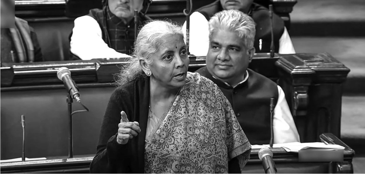
Union Finance Minister Nirmala Sitharaman speaking in Rajya Sabha during the Winter Session of Parliament

The Congress holds the record of winning 149 seats in 1985 under the leadership