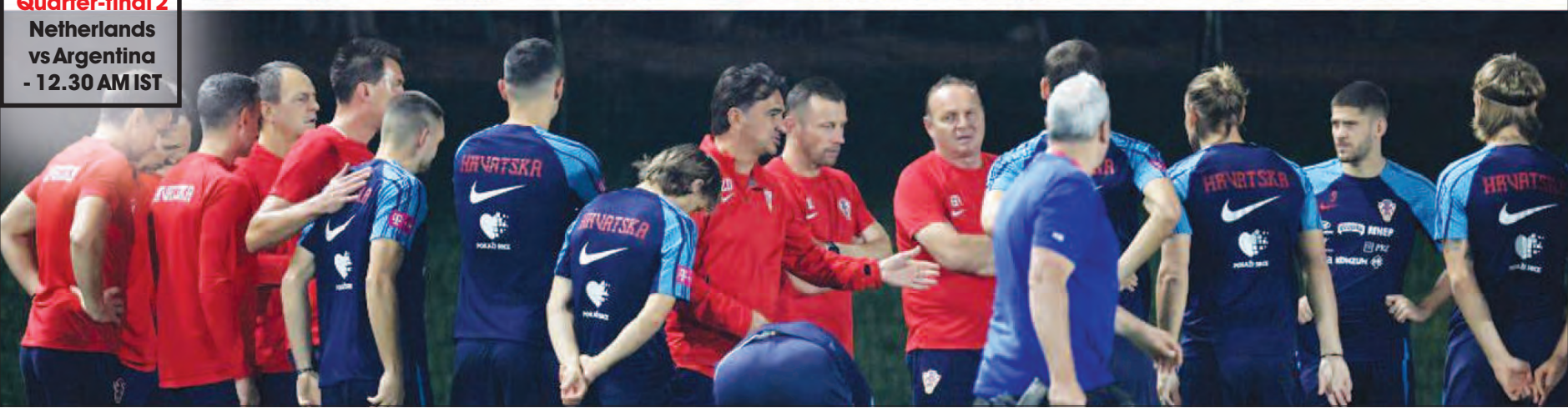
Brazil (top) and Croatia during their respective training sessions in preparation for the quarterfinal

Today's Match Quarter-final 1 Croatia vs Brazil - 8.30 PM IST Quarter-final 2 Netherlands vs Argentina - 12.30 AM IST