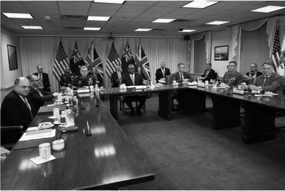
U.S. Defense Secretary Lloyd Austin, Australian Defence Minister Richard Marles and British Defense Secretary Ben Wallace meet at the Pentagon in Washington