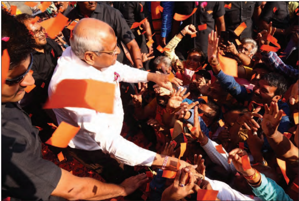
(Left to right) Gujarat chief minister Bhupendra Patel greeting people after winning the Assembly election at Ghatlodia area, in Ahmedabad on Thursday. Congress supporters celebrating victory in Kullu on Thursday

Successive 7th term for BJP in Gujarat, Cong bags HP; Kejriwal declares AAP national party