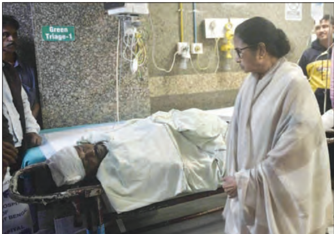
Chief Minister Mamata Banerjee visiting a person who was admitted to SSKM trauma care centre after he was injured in a road accident at Chingrighata