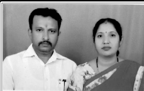
HAPPY SILVER JUBILEE On 23-04-2022 Best Wishes from: Mummy, Sisters & all family members.