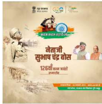
name of Param Veer Chakra (See page 6)

Thereafter, the Prime Minister will also announce the naming of 21 Islands of Andaman and Nicobar in the