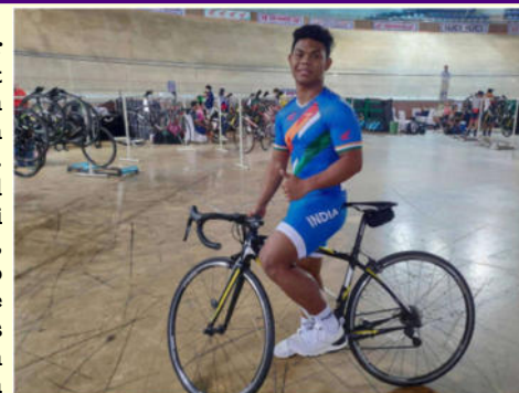
International cycling sensation -Master Esow Alben

World Champion and recipient of prestigious 'Bal Shakti Puraskar' 2019.