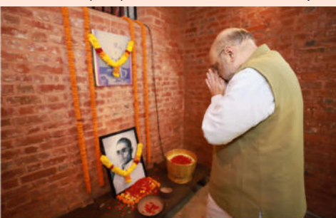
Hon'ble Minister, Shri Amit Shah paying homage to Veer Savarkar at his cell