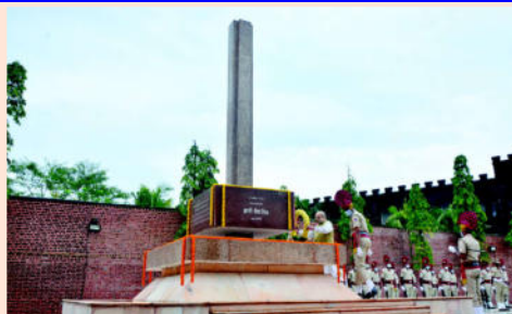
Hon'ble Minister laying wreath at Martyrs' Column at Cellular Jail