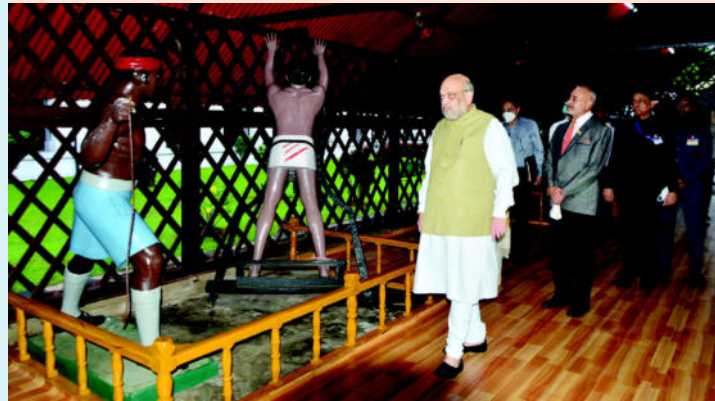
Hon'ble Minister, Shri Amit Shah at Cellular Jail Museum

Hon'ble Minister further said that the history of this jail is that from the revolution of 1857 to 1938, all the freedom fighters who were a headache for the British were brought here. About a thousand freedom fighters spent the best years of their lives here in suffering. Many people died here and many people even went mad but they did not bow down to the British. After the revolt of 1857, 90 percent of the people who were brought here were cultural scholars, landowners, great fighters and warriors. Such people were engaged in the work of building a jail by giving them wages, but still they did not give an apology. They did not let the flame of patriotism extinguish even for a moment and continued to fight for freedom. He stated that many people did not know how many people came here from the revolution of 1857 till independence. Phadke ji from Maharashtra, freedom fighter of Manipur, warriors of Ghadar movement of Punjab and Anushilan Samiti of Bengal came and freedom fighters of Alipore case were brought here. He said that there is a long list of such brave fighters who have suffered here for Maa Bharati.