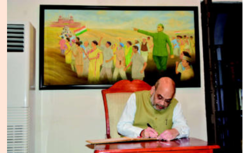
Hon'ble Minister penning his thoughts in the Visitor's Book at Cellular Jail