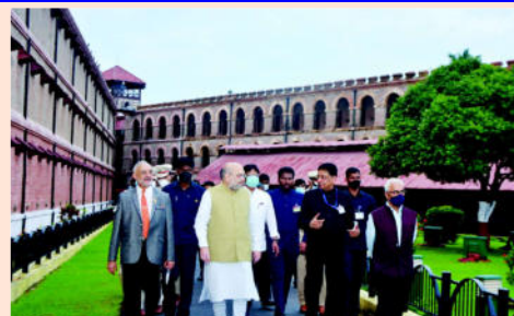
Hon'ble Minister, Shri Amit Shah at National Memorial Cellular Jail