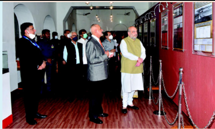
Hon'ble Minister, Shri Amit Shah at Cellular Jail Gallery

Hon'ble Minister called upon the youth across the country that we were born only after independence, we did not get a chance to die for the country but can we live for the country. We can decide to live for the country. He said that if we want to take this decision, then there can be no better occasion than the Azadi ka Amrit Mahotsav and no better place than the Cellular Jail. He said that Prime Minister, Shri Narendra Modi has a dream to connect the youth of the country with the resolve to develop the country, the future of the country and make the country great. Shri Amit Shah said, "I am very proud that I have come to this pilgrimage site to pay homage to the Martyrs who laid down their lives for the country, on the occasion of the Azadi ka Amrit Mahotsav".