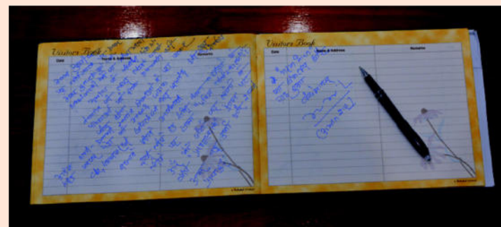
Hon'ble Union Minister of Home Affairs and Minister of Cooperation, Shri Amit Shah's remarks in the Visitor's Book