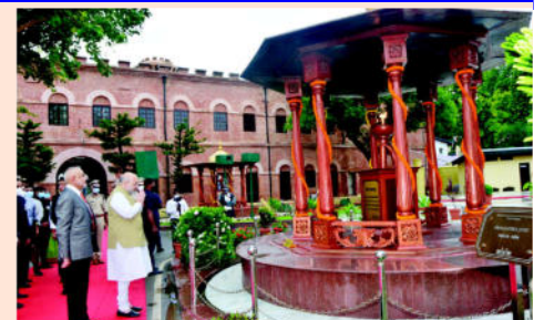
Hon'ble Minister paying homage at Swatantra Jyoti at Cellular Jail