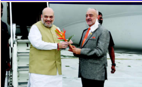
Hon'ble Union Minister of Home Affairs and Minister of Cooperation, Shri Amit Shah being received by the Lt Governor, A&N Islands Admiral DK Joshi, PVSM, AVSM, YSM, NM, VSM (Retd.) at Veer Savarkar International Airport