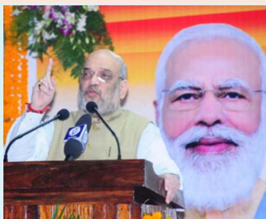
Hon'ble Minister, Shri Amit Shah addressing the gathering at National Memorial Cellular Jail

The Hon'ble Minister said that his visit to this pilgrimage place is also important because this year is the year of 'Azadi Ka Amrit Mahotsav', the year to dedicate himself again to the country by taking inspiration from the freedom struggle and it is the year to take a resolution about how great India will be, when the hundred years of the country's independence will be completed. He said, that is why the Prime Minister of the country,