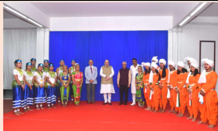
Hon'ble Minister, Shri Amit Shah with the participants of cultural programme held at Raj Niwas

Hon'ble Minister said that the airlift point was also built by Modi ji. Netaji came here and first of all, if any territory in India has the honor of being independent from the British, then Andaman and Nicobar have it. The National Flag of India was first hoisted here in 1943 by Netaji and our Prime Minister, Shri Narendra Modi has done the work of hoisting the 100 feet high tricolor at the same place. Three islands have also been renamed, Havelock Island as Swaraj Dweep and Neil Island as Shaheed Dweep to pay tribute to the martyrs, who sacrificed their lives here while Ross Island was renamed Netaji Subhash Chandra Bose Dweep because even though Subhash Chandra Bose had liberated this land for a short period of 2 years, now this land has