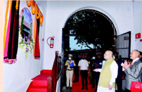
Hon'ble Minister, Shri Amit Shah unveiling the plaque with the quote "Holy Pilgrimage Place of Freedom Struggle of India" at Cellular Jail